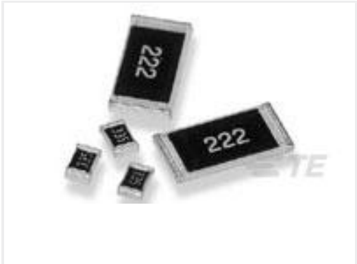
TE Part #1623292-1 CRG0805 1% 8K2