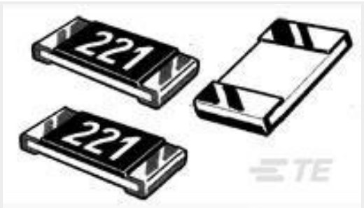
TE Part #1622820-4 3520 10R 5%