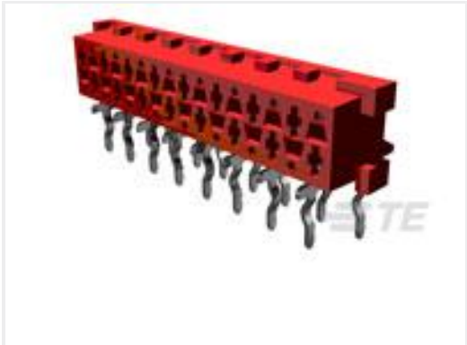
TE Part #1-215460-2 MICRO-MATCH FEM.SE