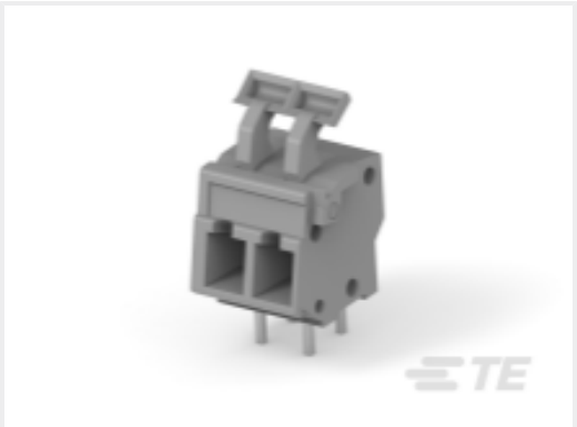
TE Part #2834082-1 5.0MM SIDE ENTRY MSC 2P_GY