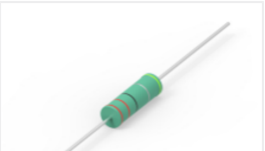
TE Part #7-2176613-3 EP 4W (SS) 1K0 5%