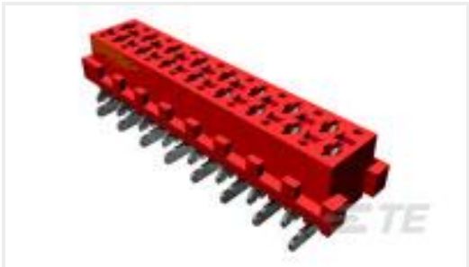
TE Part #188275-8 MICRO-MATCH SMD FTE