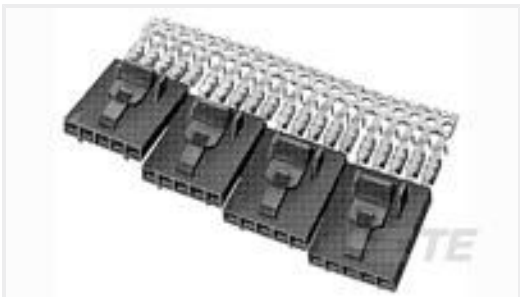
TE Part #5-103958-1 10X2 MTE RPT SR LATCH .100CL