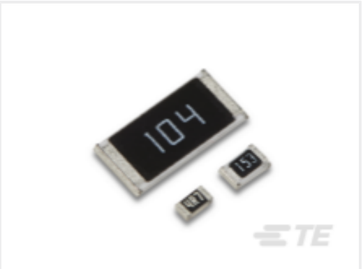
TE Part #2176337-7 CRGCQ 0402 33R 1%