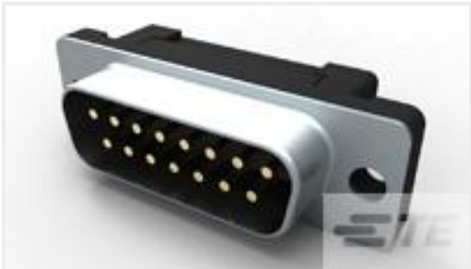
TE Part #1658613-3 15 POS HDF PLUG, MS, LEAD FREE