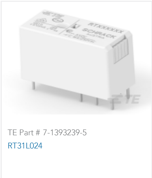
TE Part # 7-1393239-5 RT31L024