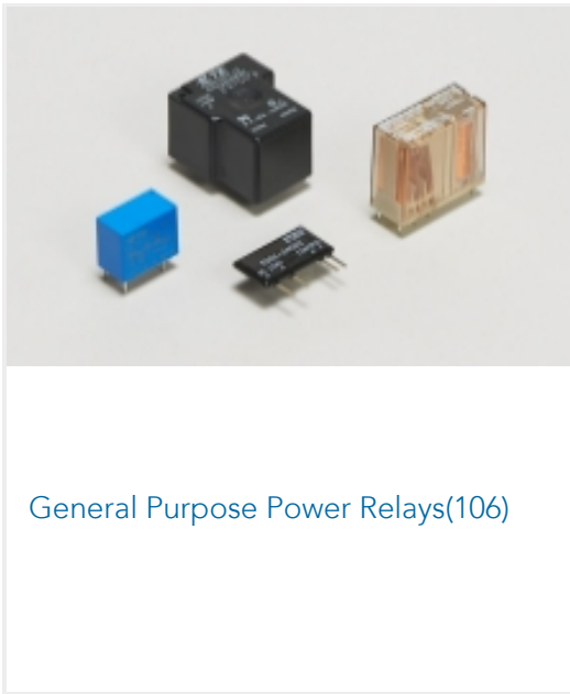
General Purpose Power Relays(106)