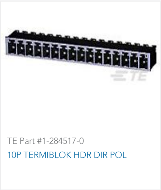
TE Part #1-284517-0 10P TERMIBLOK HDR DIR POL