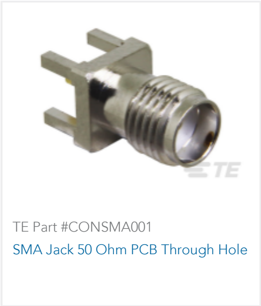
TE Part #CONSMA001 SMA Jack 50 Ohm PCB Through Hole