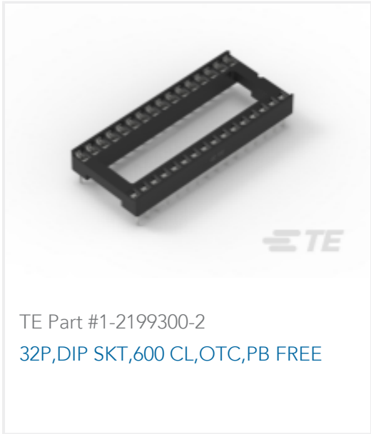
TE Part #1-2199300-2 32P,DIP SKT,600 CL,OTC,PB FREE