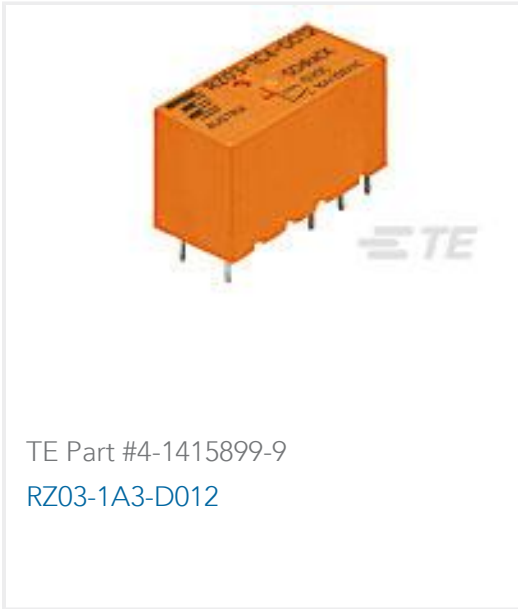
TE Part #4-1415899-9 RZ03-1A3-D012