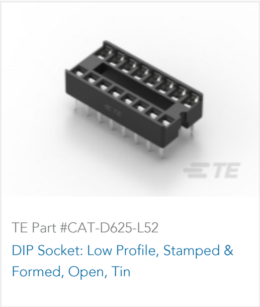
TE Part #CAT-D625-L52 DIP Socket: Low Profile, Stamped & Formed, Open, Tin