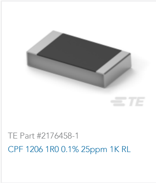
TE Part #2176458-1 CPF 1206 1R0 0.1% 25ppm 1K RL