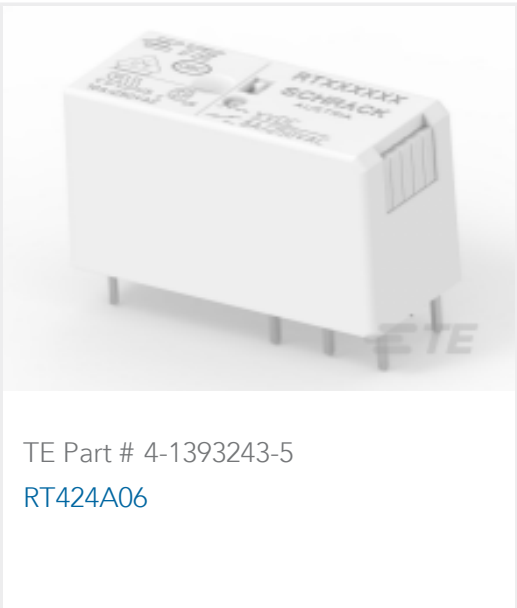
TE Part # 4-1393243-5 RT424A06