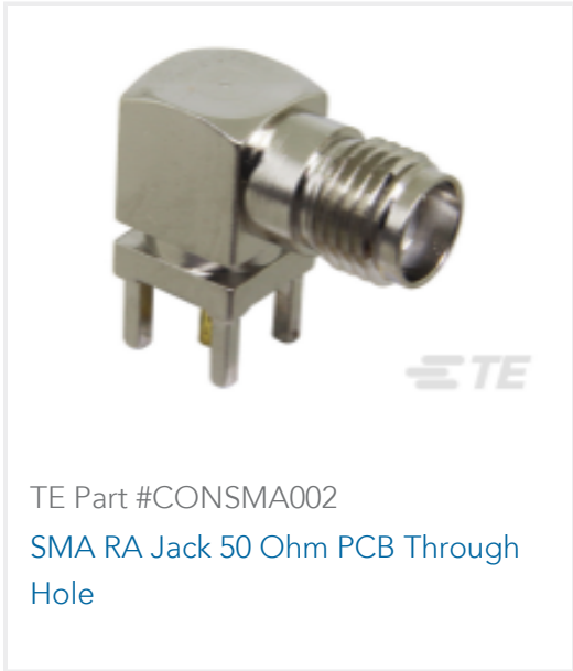
TE Part #CONSMA002 SMA RA Jack 50 Ohm PCB Through Hole