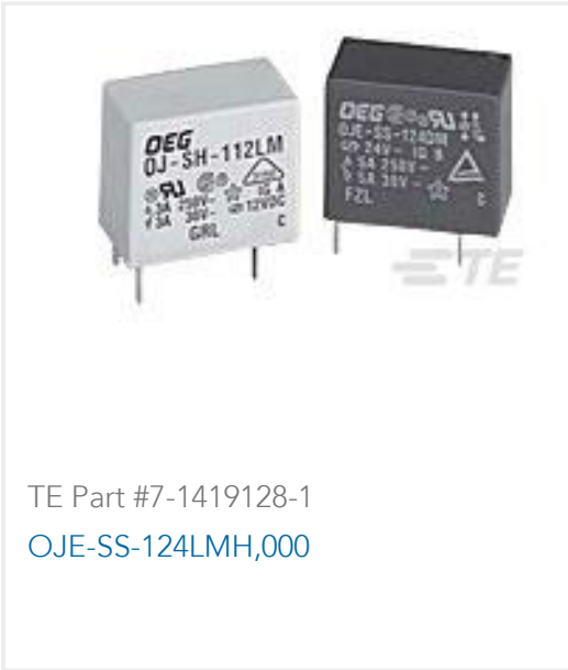
TE Part #7-1419128-1 OJE-SS-124LMH,000