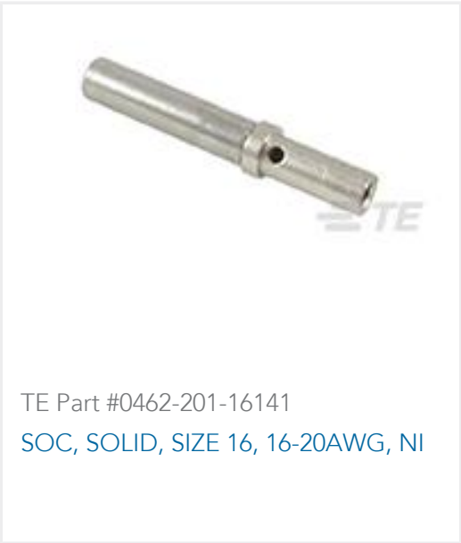
TE Part #0462-201-16141 SOC, SOLID, SIZE 16, 16-20AWG, NI