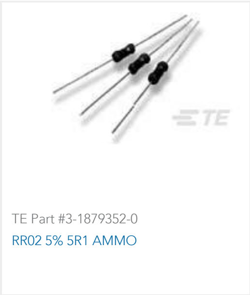
TE Part #3-1879352-0 RR02 5% 5R1 AMMO