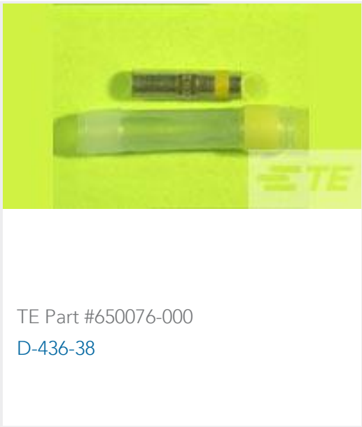
TE Part #650076-000 D-436-38