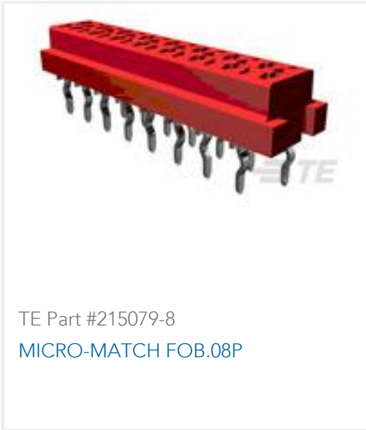
TE Part #215079-8 MICRO-MATCH FOB.08P