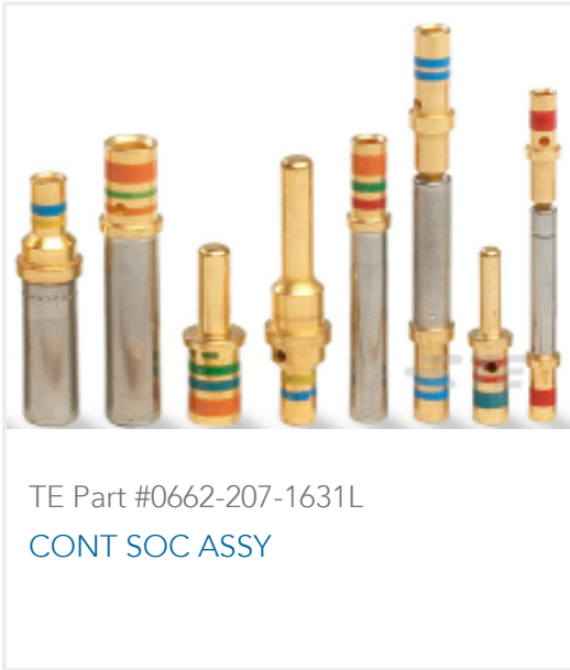
TE Part #0662-207-1631L CONT SOC ASSY