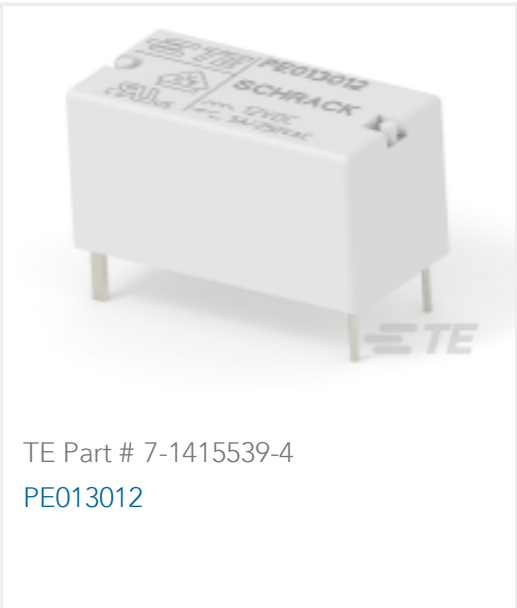
TE Part # 7-1415539-4 PE013012