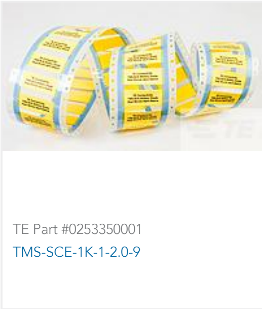
TE Part #0253350001 TMS-SCE-1K-1-2.0-9