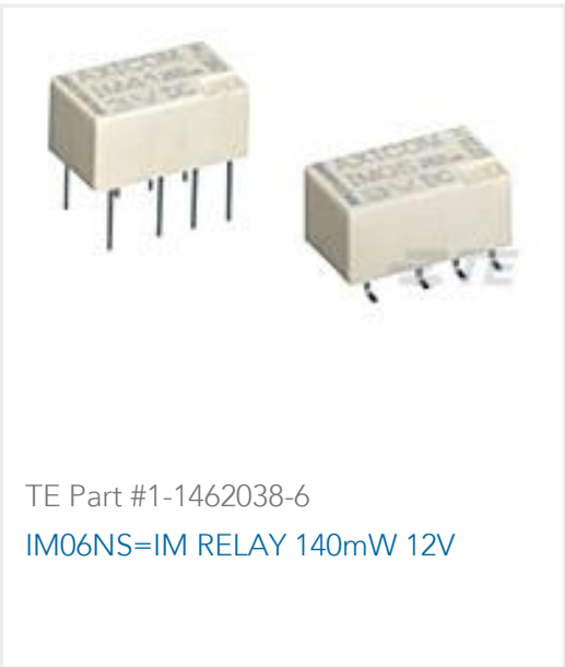
TE Part #1-1462038-6 IM06NS=IM RELAY 140mW 12V