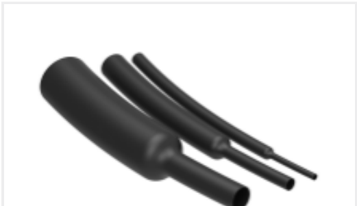
TE Part #2499356001 CGPT-R-2.4-0