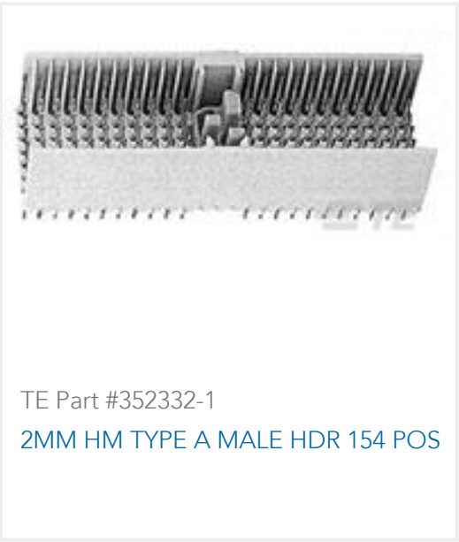
TE Part #352332-1 2MM HM TYPE A MALE HDR 154 POS