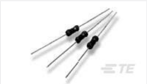
TE Part #7-1625892-9 3W SM M/OX 5% 8R2