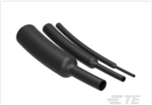
TE Part #3251936001 CGPT-R-3.2-0