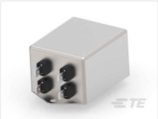
TE Part #4-1609966-2 KES 6A 1S SPADE WYE 520VAC