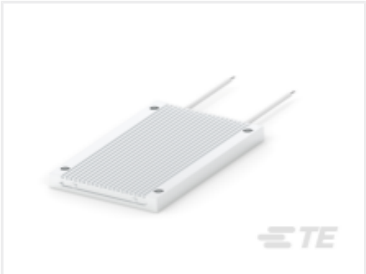
TE Part #1-2176250-0 TJT 500W 33R 5%