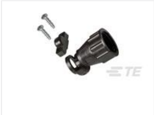
TE Part #1-206062-4 CABLE CLAMP KIT #11