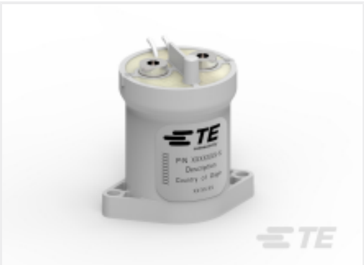
TE Part #2138602-1 RELAY,EVC135,24 VDC COIL,165mm WIRE

Product Drawings EV202MSAND=RELAY, EV202 DPST-NO, 28V English