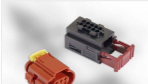
TE Part #CAT-T4827-CH8172 Timer Connector Housing