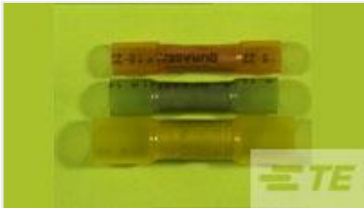
TE Part #CC2619-000 D-406-0001CS100