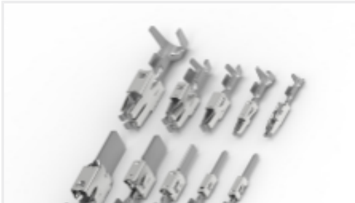
TE Part #CAT-T4827-T273 TIMER, RECEPTACLE AND TAB