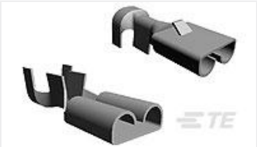
TE Part #42282-1 FF 250 REC 18-14AWG BR LP