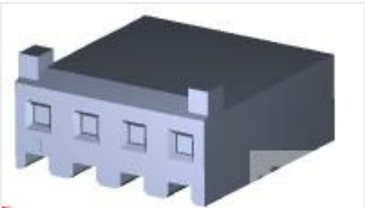
TE Part #770849-4 04P SL156 HSG W/LCK RMP & TABS