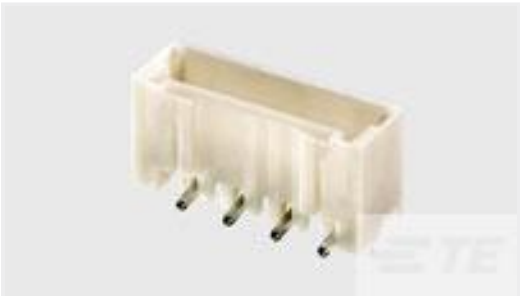
TE Part #292232-4 1.5 MINI CT SGL V SMT W/BOS,PO BLUE