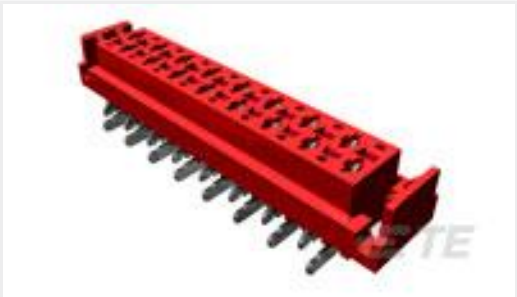
TE Part #9-338069-4 MICRO-MATCH SMD FTE