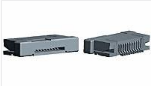
TE Part #1734592-6 FPC CONN. 0.5MM PITCH B/C, 6P