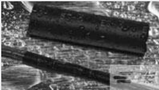
TE Part #063725P012 ES2000-NO.2-B9-0-65MM