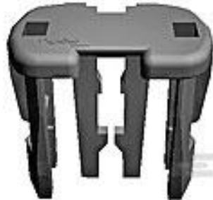
TE Part #1827120-1 SQUIB LOCKING BUTTON