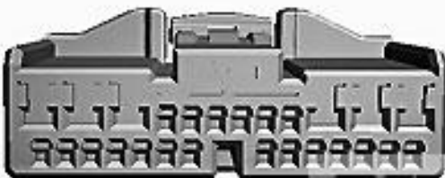
TE Part #1674932-1 0.64 III/2.3 II 26POS PLUG ASSY