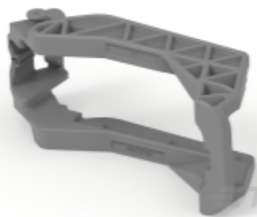
TE Part #2069775-1 0.50/1.0 SEALED LEVER 140POS MARK-2