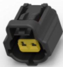
TE Part #178448-2 EJ-2 DBL LOCK PLUG 2P ASSY B