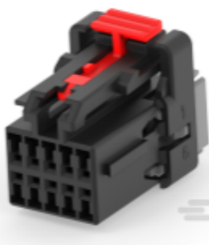
TE Part #638393-5 10P PLUG ASSY A KEY -W/ CPA