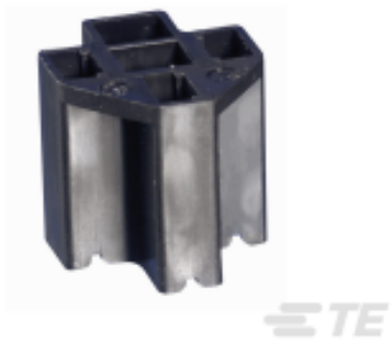
TE Part # 1-1904045-1 V23333Z0001A007-EV-100