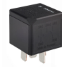
TE Part #7-1414985-1 V23136A0004X075-EV-CBOX