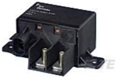
TE Part #1-1393315-1 V23132B2002B200=HCR