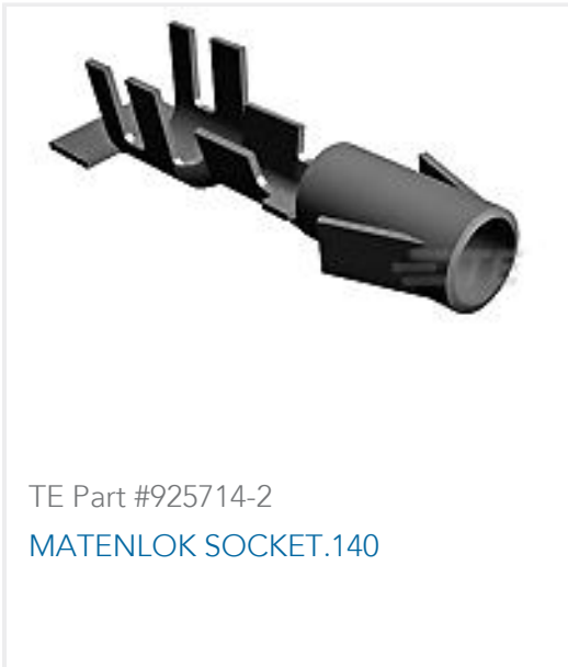
TE Part #925714-2 MATENLOK SOCKET.140