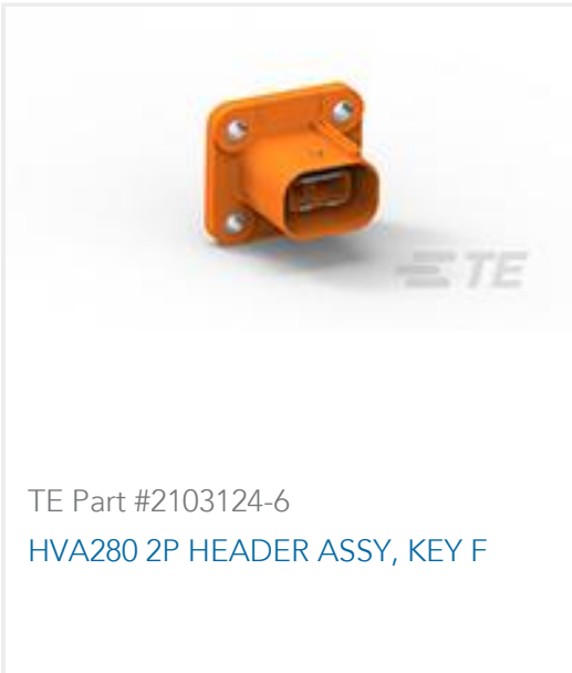
TE Part #2103124-6 HVA280 2P HEADER ASSY, KEY F