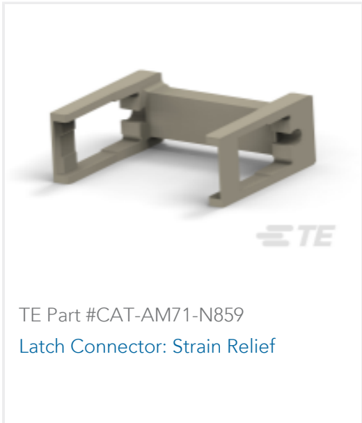
TE Part #CAT-AM71-N859 Latch Connector: Strain Relief