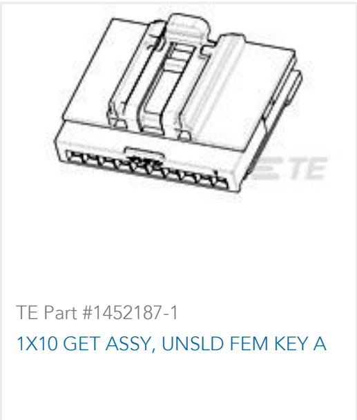
TE Part #1452187-1 1X10 GET ASSY, UNSLD FEM KEY A