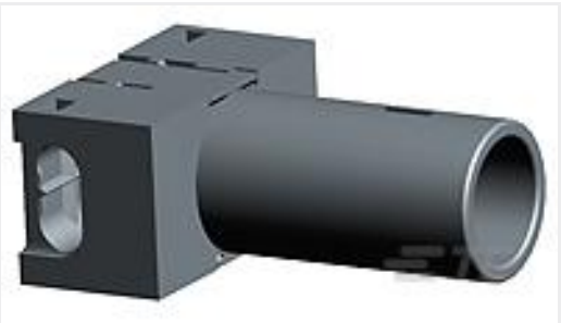
TE Part #1-2213222-1 NECTOR S BUS BAR SEALED US, THRU HV-3