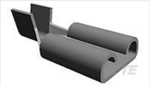
TE Part #62852-1 110 FASTON REC 18-14 AWG TPBR