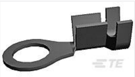
TE Part #60772-2 RING CRIMP 18-14 AWG TPBR