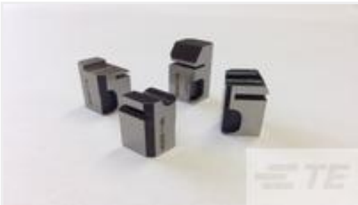
TE Part #469542-3 FLOATING SHEAR