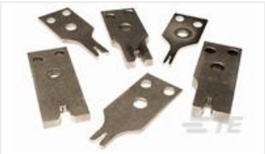
TE Part #2076539-3 INSULATION CRIMPER SPECIAL