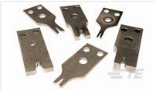
TE Part #9-1707070-3 WIRE CRIMPER