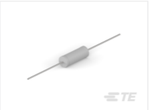
TE Part #5-2176412-8 5W XSM M/OX 5% 1K2