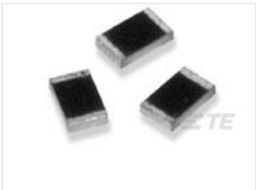
TE Part #2-1625868-0 RP 2A 0.25W 100K 0.1% 25PPM 1K RL