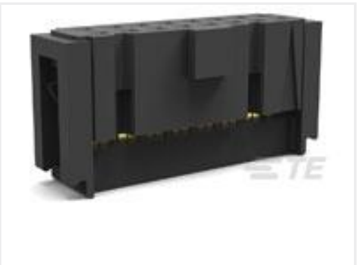
TE Part #1658527-2 622-0630LF FEM SOCKET,LEAD FREE