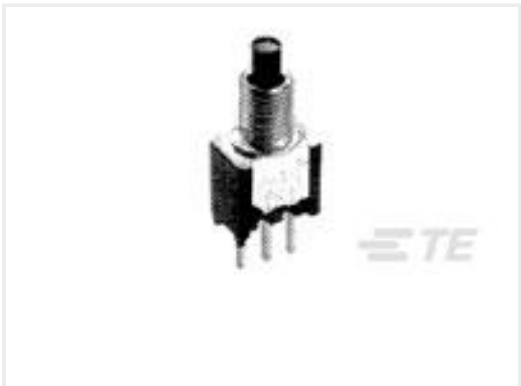
TE Part #1825098-1 TPC11CGPC004