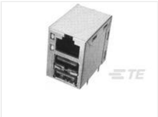
TE Part #6116151-1 MJ,2X1RJ45+2USB,BLACK,NOLEDS