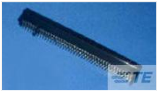
TE Part # 1734774-1 PCI EXP 3.1L 36 POS WHT G/F

on SVHC in articles for this part number is based on the latest European Chemicals Agency (ECHA) ‘Guidance on requirements for substances in articles’ posted at this URL: https://echa.europa.eu/guidance-documents/guidance-on-reach