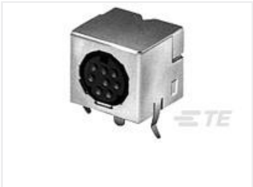
TE Part #5749181-1 Mini DIN, 4 pos, R/A, Shield