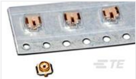
TE Part #1909763-1 UMCC MICRO-COAX RECPT GEN 1 HIGHER LEVEL