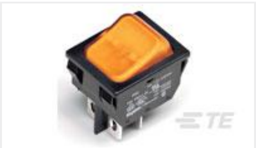
TE Part #1634201-3 PRFDA1-16F-BB0CW