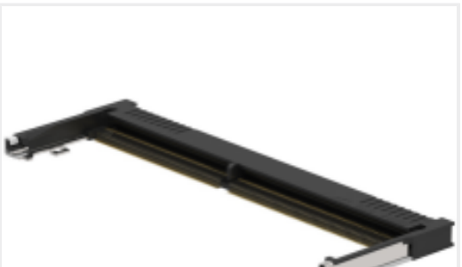
TE Part #2309407-2 DDR4 SODIMM 260P 4.0H STD