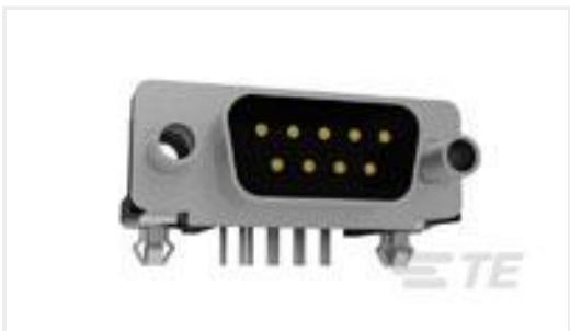
TE Part #5747844-6 09 MSFL RCPT RA 318 (SL,FM,BL)