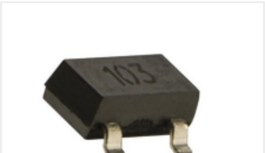
TE Part #G-NICO-001 NI 1000 DIN 43760 KLB SOT23