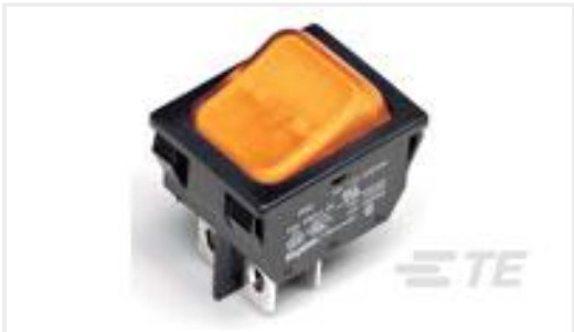
TE Part #1634201-1 PRFDA1-16F-BB000