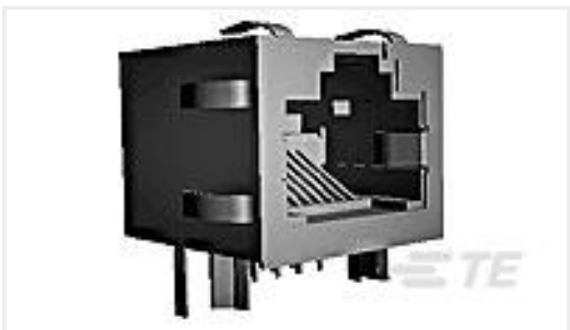
TE Part #1-406541-1 MJ,INV,1X1,6PNL G.,100"ST,SN