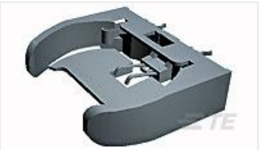
TE Part #1775485-1 Battery Holder, 3.6mm, BLK,low profile