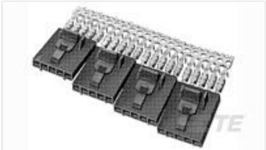
TE Part #5-103956-7 2X8 MTE RCPT SR LATCH .100CL