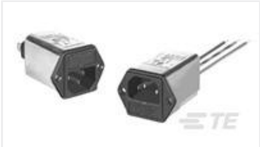
TE Part #6609115-3 1EGG1-2 (NEW GEN=F7642D S0)