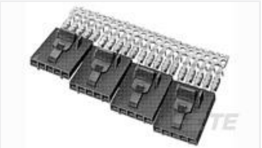
TE Part #5-103956-6 2X7 MTE RCPT SR LATCH .100CL