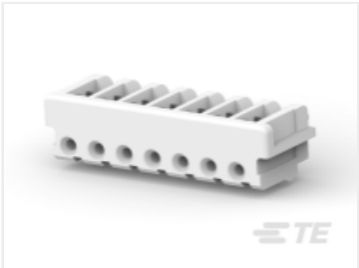
TE Part # 173977-7 CT CONN MT REC ASSY 7P