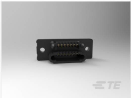
TE Part # 292177-1 MINI DRAWER CONN FOR CT 14P

This information is provided based on reasonable inquiry of our suppliers and represents our current actual knowledge based on the information they provided. This information is subject to change. The part numbers that TE has identified as EU RoHS compliant have a maximum concentration of 0.1% by weight in homogenous materials for lead, hexavalent chromium, mercury, PBB, PBDE, DBP, BBP, DEHP, DIBP, and 0.01% for cadmium, or qualify for an exemption to these limits as defined in the Annexes of Directive 2011/65/EU (RoHS2). Finished electrical and electronic equipment products will be CE marked as required by Directive 2011/65/EU. Components may not be CE marked. Additionally, the part numbers that TE has identified as EU ELV compliant have a maximum concentration of 0.1% by weight in homogenous materials for lead, hexavalent chromium, and mercury, and 0.01% for cadmium, or qualify for an exemption to these limits as defined in the Annexes of Directive 2000/53/EC (ELV). Regarding the REACH Regulation, the information TE provides on SVHC in articles for this part number is based on the latest European Chemicals Agency (ECHA) ‘Guidance on requirements for substances in articles’ posted at this URL: https://echa.europa.eu/guidance-documents/guidance-on-reach