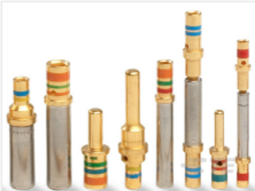
TE Part #0641-2-1631L CONT PIN