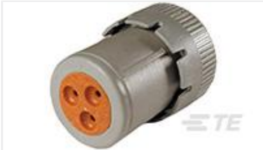
TE Part #HD16-3-16S PLG, 3P, GRY, N, 16