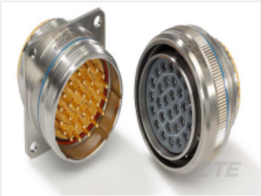
TE Part #ZPF000000000008846 983-6SE 14-07 SN