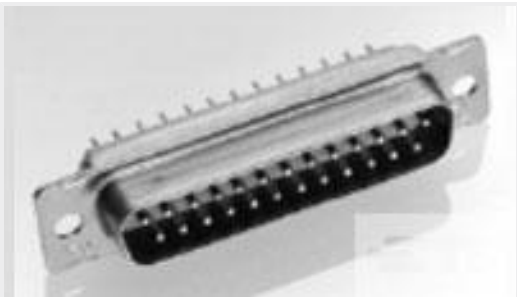
TE Part #205564-2 AMPLIMITE,ASY,PLUG,STD,109,5