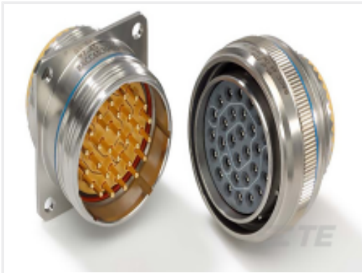
TE Part #ZPF000000000008767 983-6SE 10-06 SN