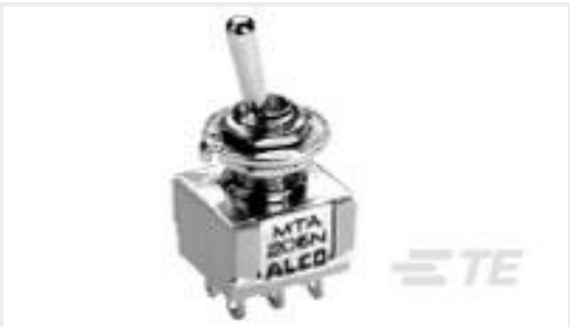
TE Part #3-1437559-7 MTL206N=(MSTL) SW TOG LOCKING