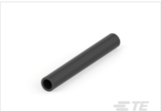
TE Part #CAT-HST-HTAT HTAT Heat Shrink Tubing