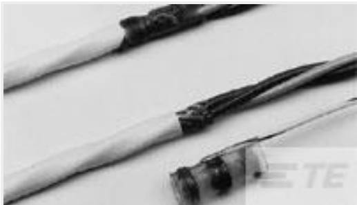
TE Part #740072-000 SO63-3-01