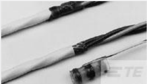
TE Part #236856-000 SO96-3-01