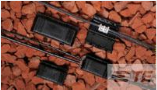
TE Part #294925-000 GHFC-2-90(B10)