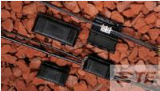
TE Part #765669-000 GHFC-1-90(B10)

GHFC-GEL-H-FRAME-CLOSURE-CABLE-ACCESSORIES