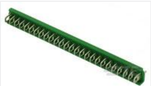
TE Part #1-5164713-1 11P.MINI-MATCH ASSY