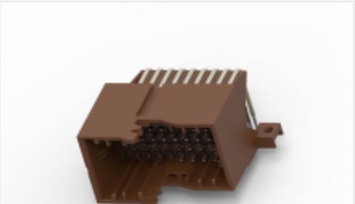
TE Part #CAT-M4599-H342 AMP MCP Unsealed Headers