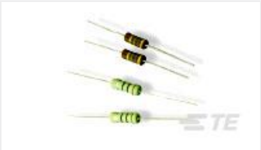
TE Part #1623719-8 CCR1 10R 10%