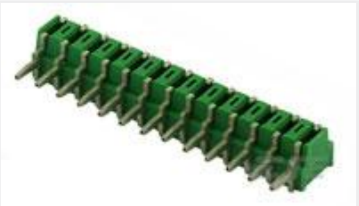
TE Part #1-5164711-2 12pos.MINI-MATCH FBTB, 2.5mm pitch