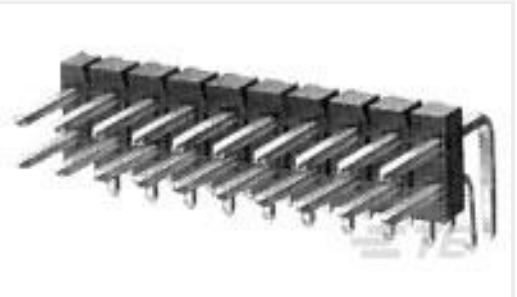
TE Part #5-826634-0 MOD2 PIN HEADER 50P