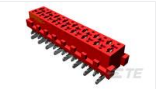
TE Part #8-188275-0 MICRO-MATCH SMD FTE