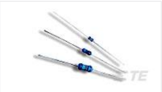
TE Part #3-1622796-0 YR1 0.1% 4K75