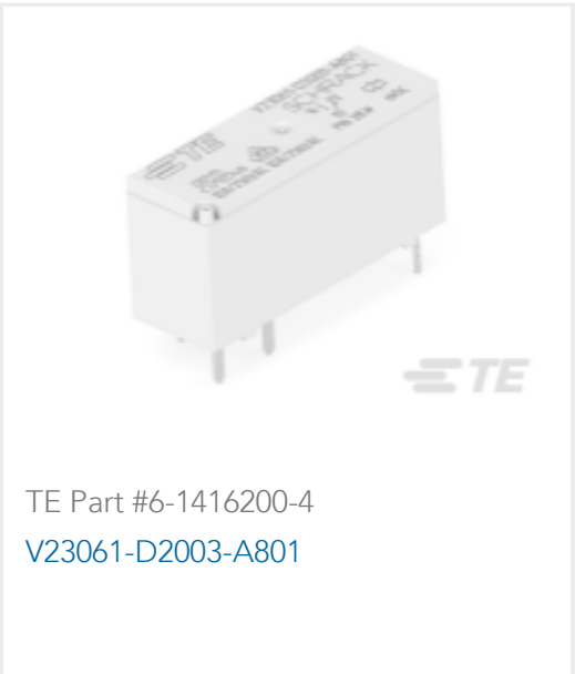
TE Part #6-1416200-4 V23061-D2003-A801