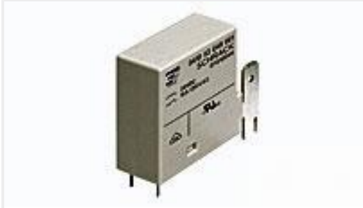
TE Part #8-1415536-7 0410 83 050 001WG