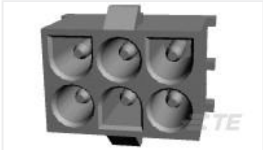
TE Part #350711-1 06P UMNL PIN HDR ASSY 94VO