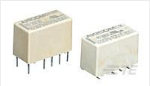
TE Part #3-1393789-7 V23079A2003B301