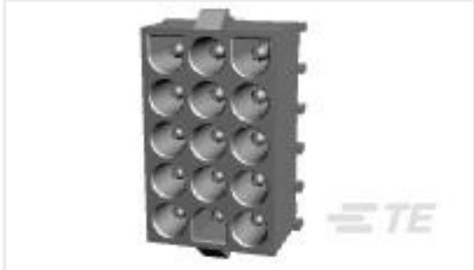
TE Part #350714-1 15P UMNL PIN HDR ASSY 94VO