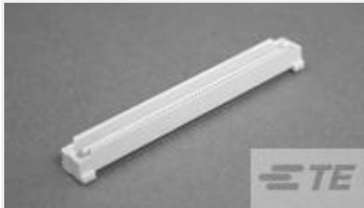
TE Part #5177986-5 0.8FH,P05H.5,120,08/Sn,TR,SC