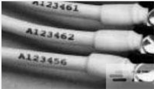
TE Part #5052952022 RNF-100-3/32-2-STK