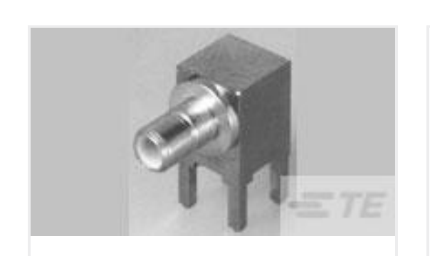
TE Part #414026-2 JACK ASSY,SMB,RT ANG