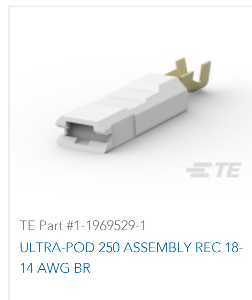
TE Part #1-1969529-1 ULTRA-POD 250 ASSEMBLY REC 18- 14 AWG BR