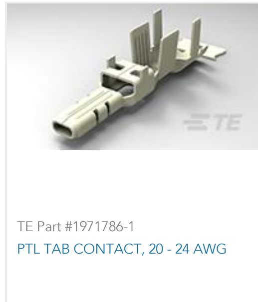
TE Part #1971786-1 PTL TAB CONTACT, 20 - 24 AWG