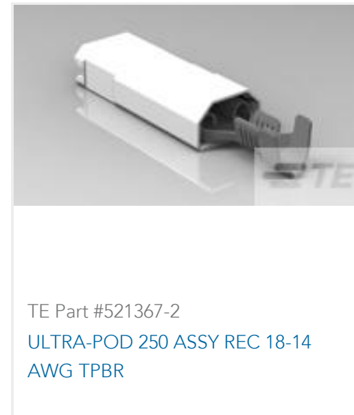
TE Part #521367-2 ULTRA-POD 250 ASSY REC 18-14 AWG TPBR