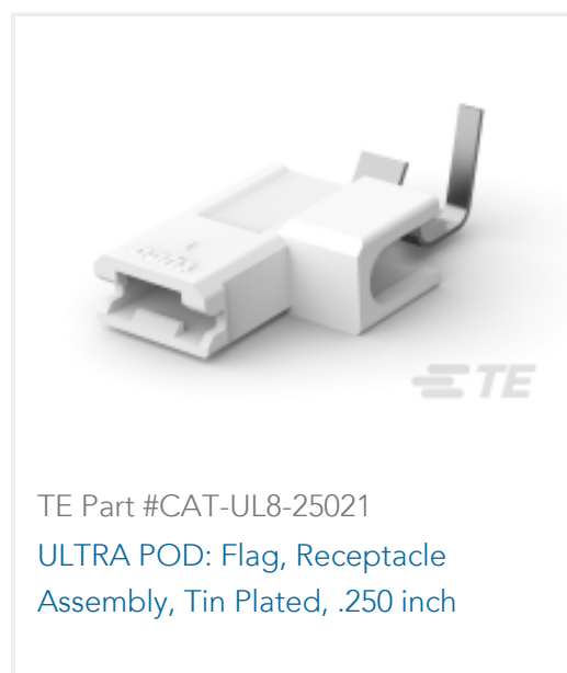
TE Part #CAT-UL8-25021 ULTRA POD: Flag, Receptacle Assembly, Tin Plated, .250 inch