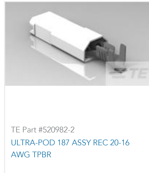
TE Part #520982-2 ULTRA-POD 187 ASSY REC 20-16 AWG TPBR