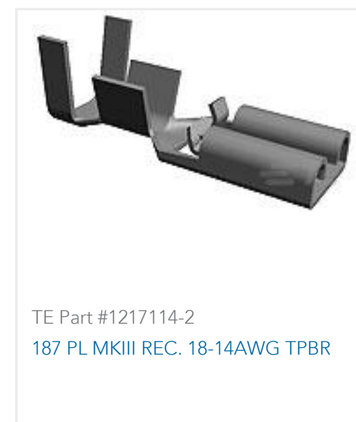
TE Part #1217114-2 187 PL MKIII REC. 18-14AWG TPBR