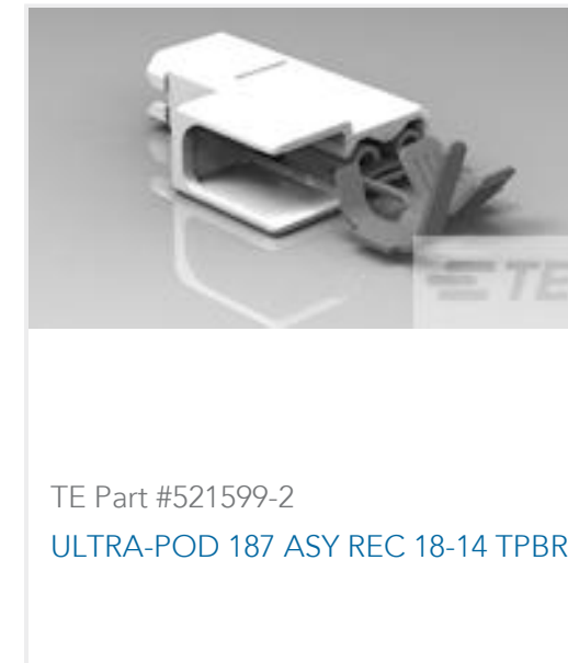
TE Part #521599-2 ULTRA-POD 187 ASY REC 18-14 TPBR