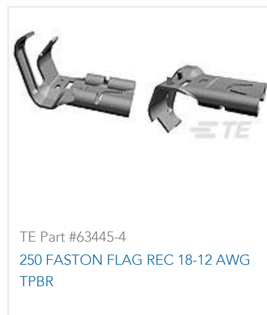
TE Part #63445-4 250 FASTON FLAG REC 18-12 AWG TPBR