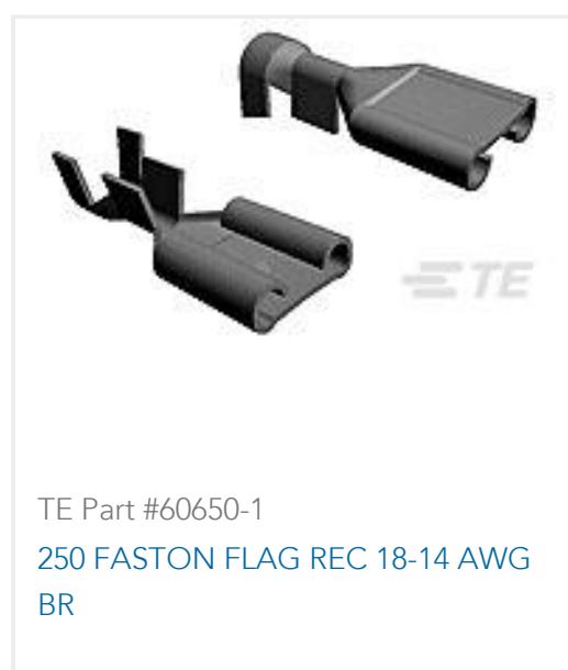
TE Part #60650-1 250 FASTON FLAG REC 18-14 AWG BR