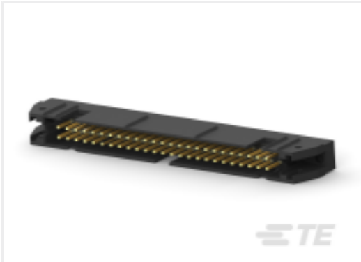
TE Part #CAT-AM74-UN384H AMP-LATCH UNIVERSAL HEADERS