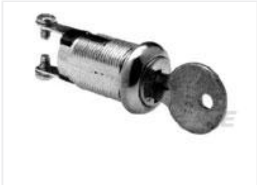
TE Part #1-1437597-7 2SWK131AL101=NON UL KEYLOCK SW