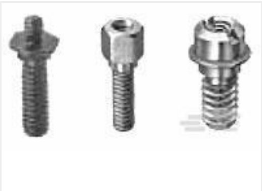
TE Part #749087-1 50SR SCREWLOCK KIT,FEMALE