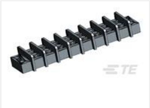
TE Part #1546670-8 8P .437" DR BARRIER,W/BND SCRW