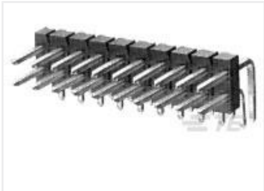
TE Part #9-103326-0 80 MODII HDR DRRA B/A .100CL