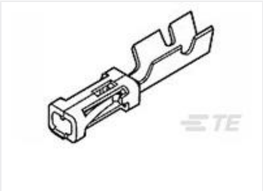
TE Part #102548-1 MOD IV RECP PLTD 15 SEL