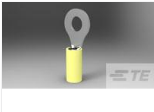
TE Part #8-35345-2 TERMINAL,PIDG R 12-10 1/4