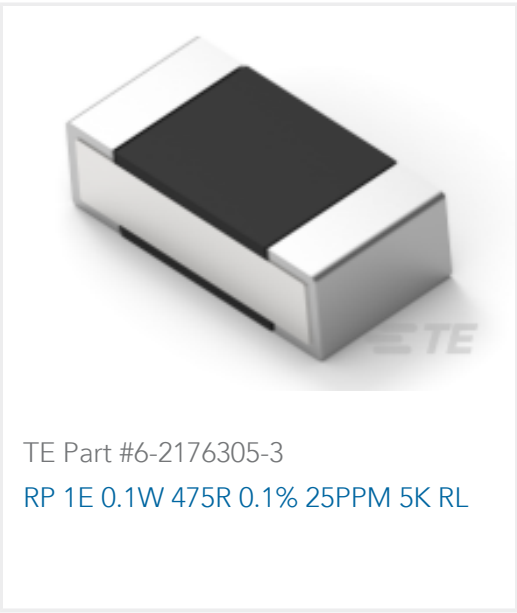
TE Part #6-2176305-3 RP 1E 0.1W 475R 0.1% 25PPM 5K RL