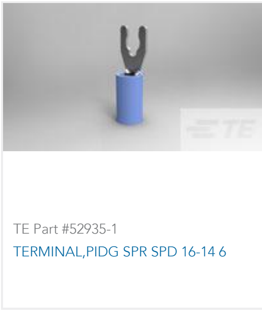
TE Part #52935-1 TERMINAL,PIDG SPR SPD 16-14 6