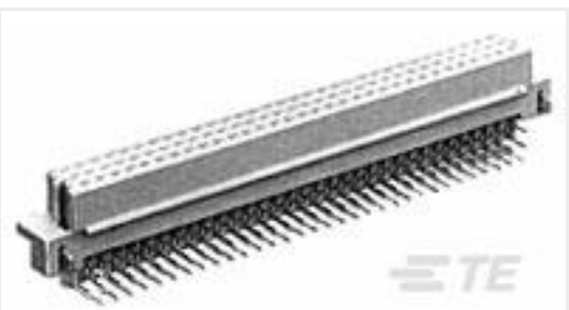
TE Part #5650868-4 ASSY,RECEPTACLE,EUROCARD,TYPE