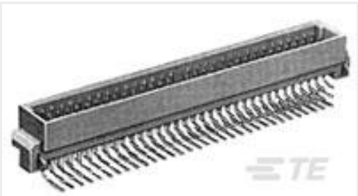
TE Part # 536407-5 048 EURO TYPE C PIN BL ASSY