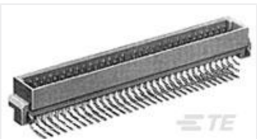
TE Part #5650916-5 ASSY,PIN,EUROCARD,TYPE C/2,LEA