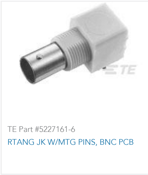
TE Part #5227161-6 RTANG JK W/MTG PINS, BNC PCB