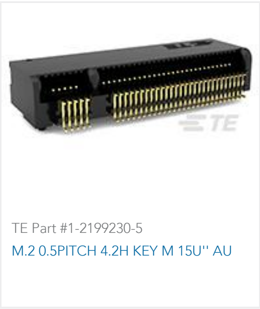
TE Part #1-2199230-5 M.2 0.5PITCH 4.2H KEY M 15U" AU