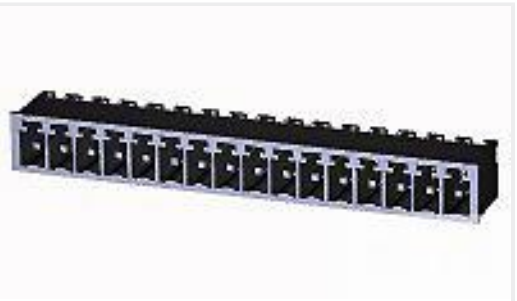
TE Part #284514-2 2 POS TERMI-BLOK HDR DIR. POL.