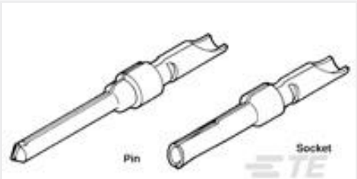
TE Part #66569-2 20DF SOCKET, PLATED