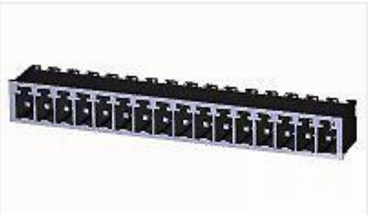
TE Part #284514-5 5 POS TERMI-BLOK HDR DIR. POL.