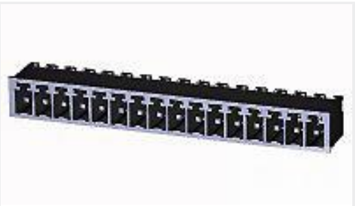
TE Part #284514-6 6 POS TERMI-BLOK HDR DIR. POL.