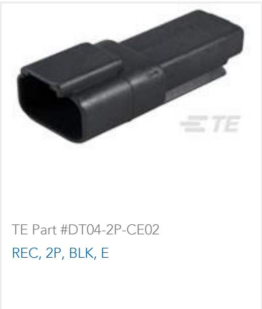
TE Part #DT04-2P-CE02 REC, 2P, BLK, E