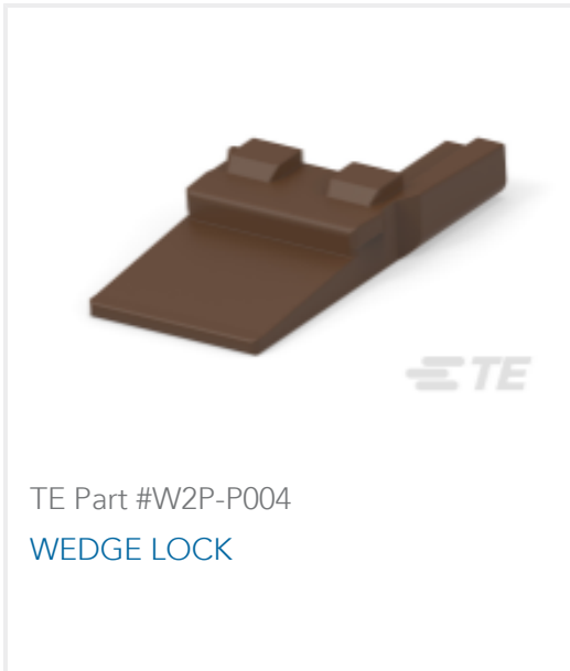
TE Part #W2P-P004 WEDGE LOCK