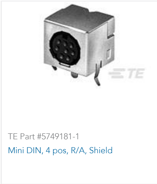
TE Part #5749181-1 Mini DIN, 4 pos, R/A, Shield