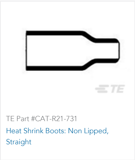
TE Part #CAT-R21-731 Heat Shrink Boots: Non Lipped, Straight