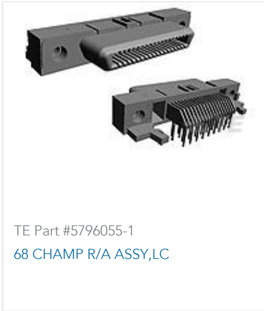
TE Part #5796055-1 68 CHAMP R/A ASSY, LC