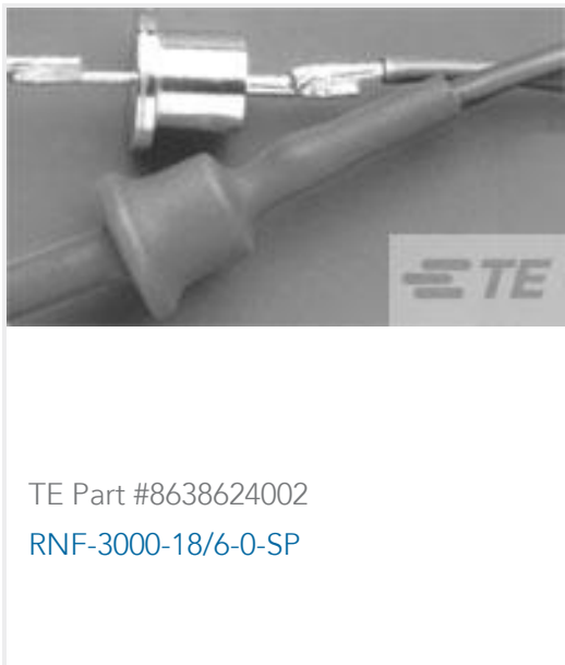
TE Part #8638624002 RNF-3000-18/6-0-SP