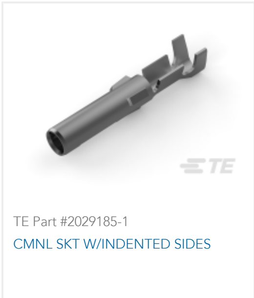
TE Part #2029185-1 CMNL SKT W/INDENTED SIDES