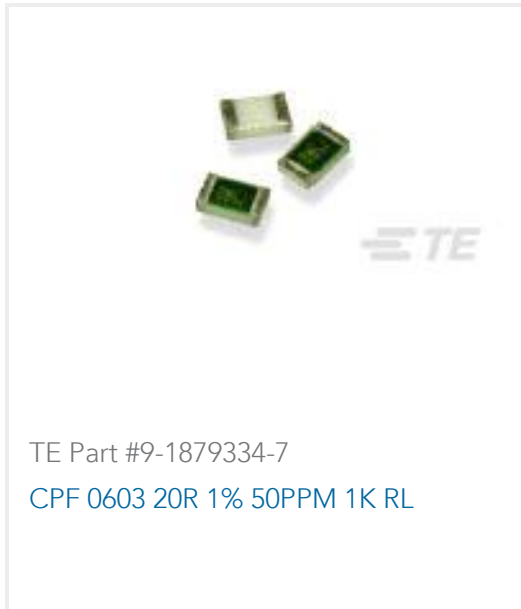
TE Part #9-1879334-7 CPF 0603 20R 1% 50PPM 1K RL