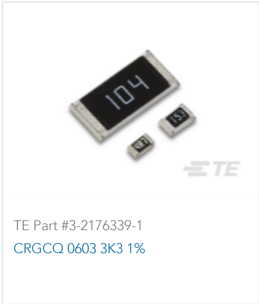
TE Part #3-2176339-1 CRGCQ 0603 3K3 1%