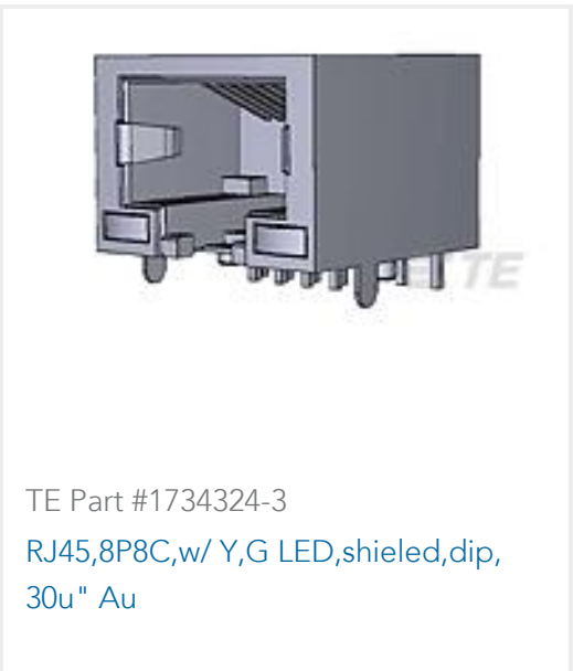
TE Part #1734324-3 RJ45,8P8C,w/ Y,G LED,shieled,dip, 30u" Au