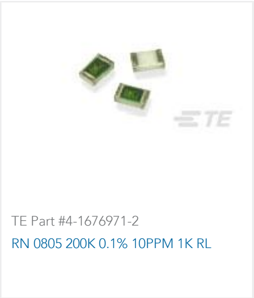
TE Part #4-1676971-2 RN 0805 200K 0.1% 10PPM 1K RL