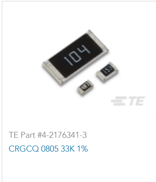
TE Part #4-2176341-3 CRGCQ 0805 33K 1%