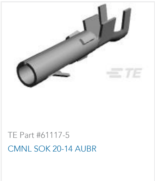
TE Part #61117-5 CMNL SOK 20-14 AUBR