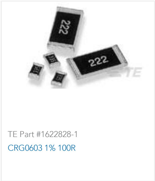
TE Part #1622828-1 CRG0603 1% 100R