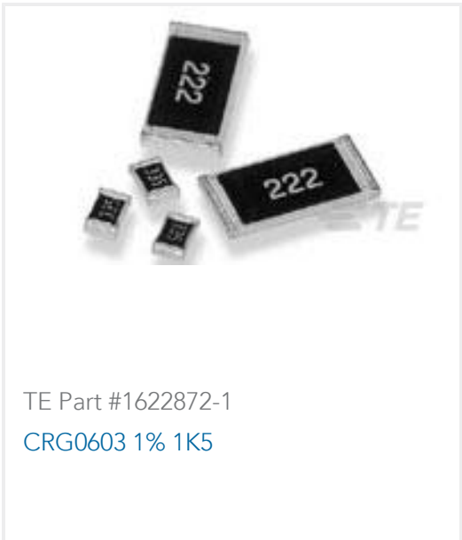
TE Part #1622872-1 CRG0603 1% 1K5