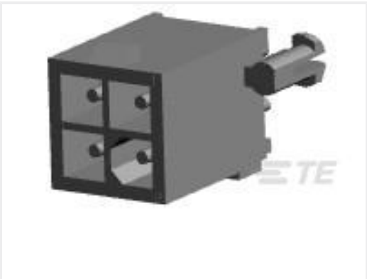
TE Part #1-770174-1 04P MINI UMNL ASSY VO SNAU LF