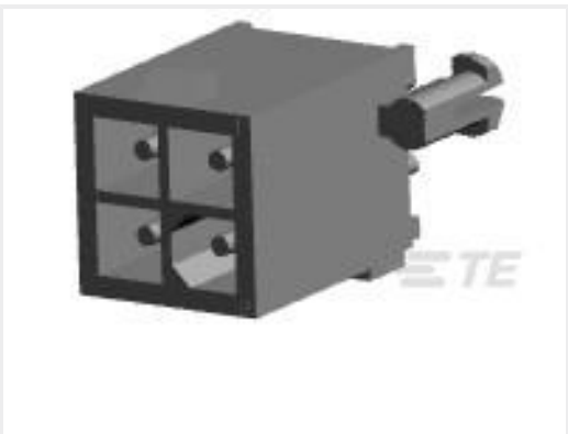
TE Part #1-770174-0 04P MINI-UMNL ASSY V0 SNNI*