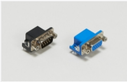
PCB D-Sub Connectors(285)