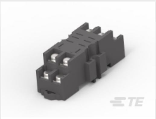
TE Part #2-1419106-7 27E895=SOCKET,K10,8,QC,POLY, DINRAIL