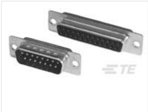
TE Part #5-747909-2 15 Rcpt Solder Cup, Gold Flash