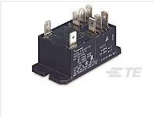
TE Part #9-1393211-0 T92S11D12-24