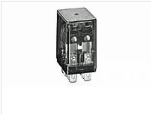
TE Part #5-1393144-7 K10P-11D15-24=K10/K20