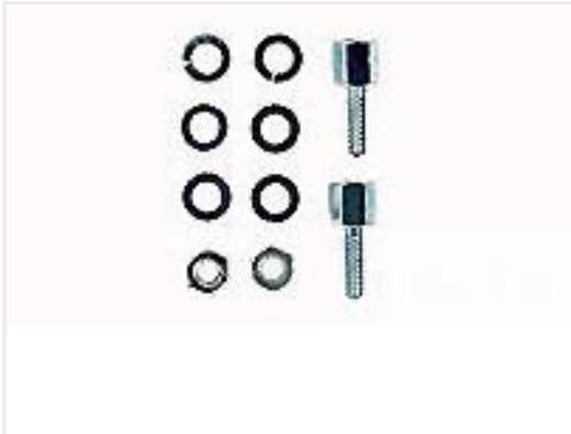
TE Part #5745563-3 HD KIT,SCREWLOCK