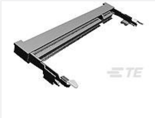
TE Part #1612618-4 SEMI-HARD TRAY DDR2 SODIMM SOCKET 200P 9