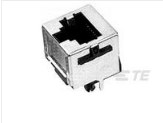
TE Part #5557969-1 MJ,TE,8P/8C,SHLD,PNL STOPS&G