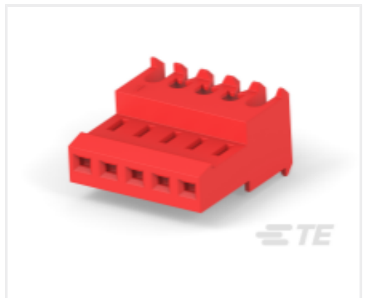
TE Part # CAT-104MTA-NGPNR Nylon Gold Plated Receptacle: 2.54 mm, no Mating Alignment