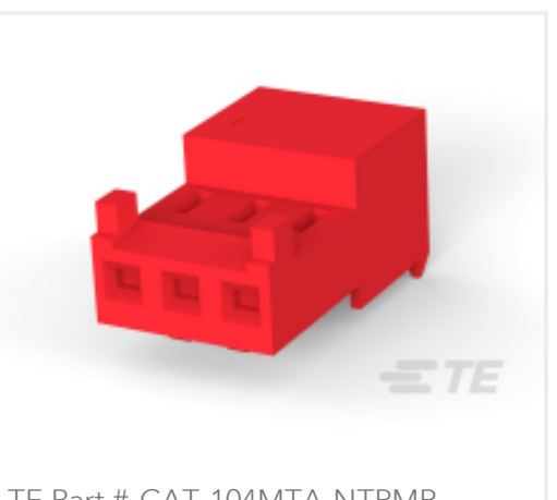
TE Part # CAT-104MTA-NTPMR Nylon Tin Plated Receptacle: 2.54 mm, with Mating Alignment, MTA 100