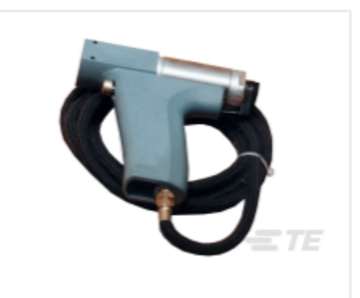
TE Part # 58075-1 MTA 50/100/156 PNEUMATIC TOOL FRAME