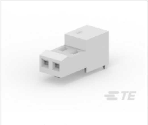
TE Part # CAT-104MTA-NTPNR MTA Receptacle: Nylon, Tin Plated, 2.54 mm