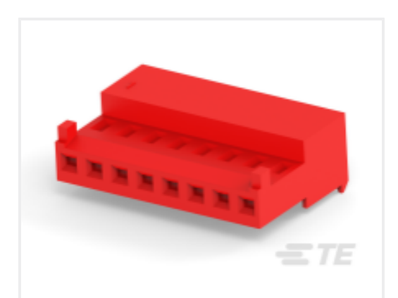
TE Part # CAT-104MTA-NGPMR Nylon Gold Plated Receptacle: 2.54 mm, with Mating Alignment, MTA 100