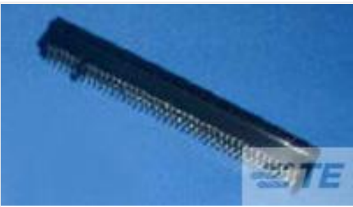
TE Part #8-1734774-1 PCI EXP 2.3L 64 POS BLK 15u"