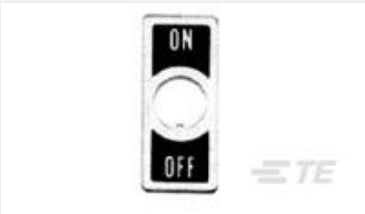
TE Part #2-1437628-6 SPA42=SW PLATE (ON-OFF) 1/4" D