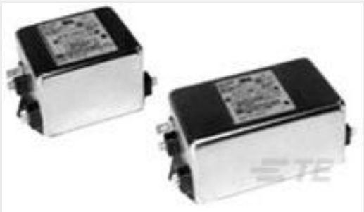
TE Part #6609052-2 10VN1=F7416 S0