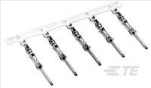
TE Part #66102-1 III+ PIN,24-20,30AU>10,STRIP