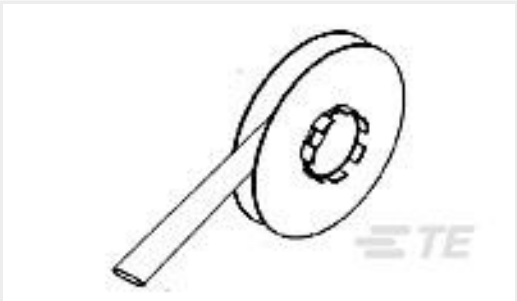
TE Part #348788-000 TTMS-19.0-0