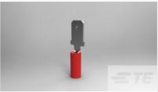
TE Part #66023-2 TAB,PIDG TERMI-BK 22-16