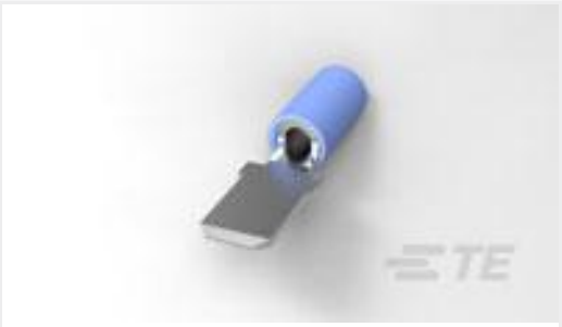
TE Part #66024-2 TAB,PIDG TERMI-BK 16-14