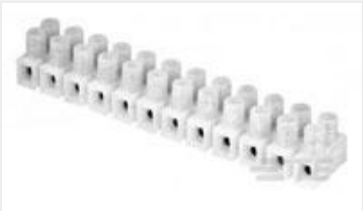
TE Part #1776295-3 TSB23003DSHT=EUROPA TM BLK, 8MM