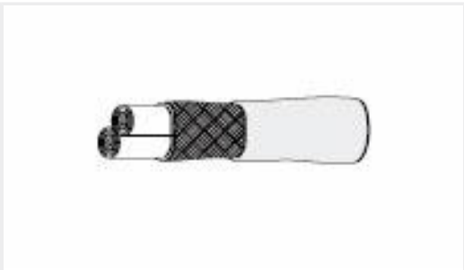
TE Part #316079-002 55A1121-26-6/9-9