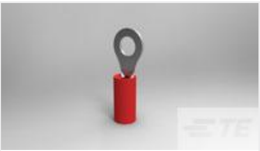
TE Part #151730 22-16 PIDG R/T 2BA NYLON EXP.1