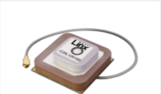
TE Part #L9000173-01 Antenna GNSS L1L2L5 25x25 LNA 1.13 UFL