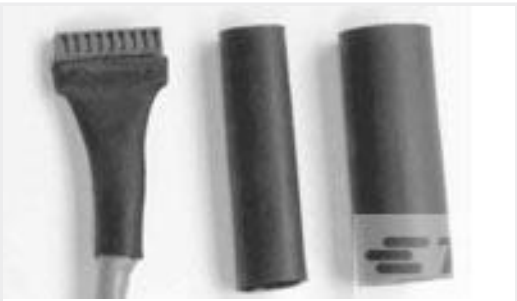
TE Part #5076682002 DWP-125-3/4-0-STK