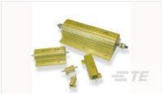
TE Part #5-1625984-6 HSA50 3R3 5%