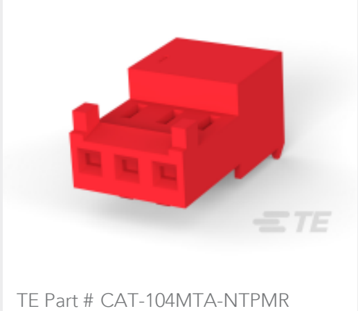
Nylon Tin Plated Receptacle: 2.54 mm, with Mating Alignment, MTA 100