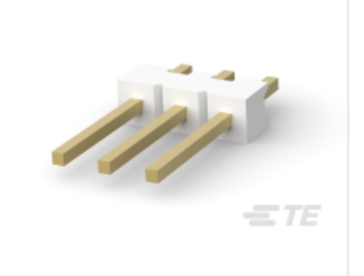
TE Part # CAT-104MTA-PVBRH Polyester Vertical PCB Header: 2.54 mm, Breakaway, MTA 100