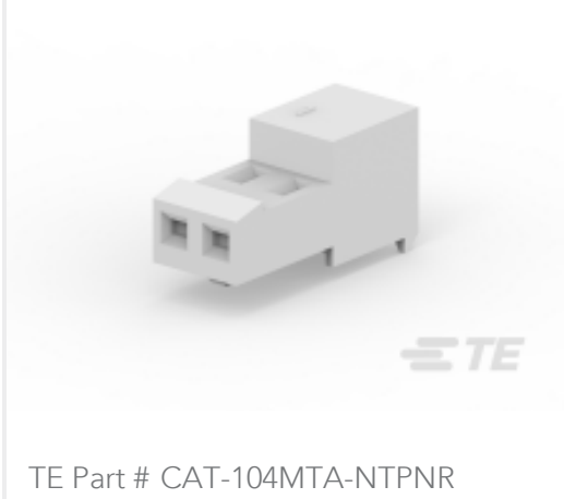
TE Part # CAT-104MTA-NTPNR MTA Receptacle: Nylon, Tin Plated, 2 54 mm