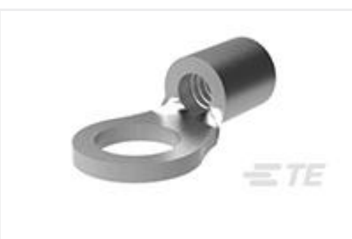
TE Part #35670 TERMINAL, SOLIS R 4 3/4