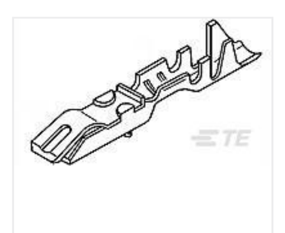
TE Part #87191-1 LOCKING CLIP ASSY .025 SQ LP