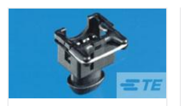
TE Part #282191-2 SPLASH PROOF CONN. W.S.L.