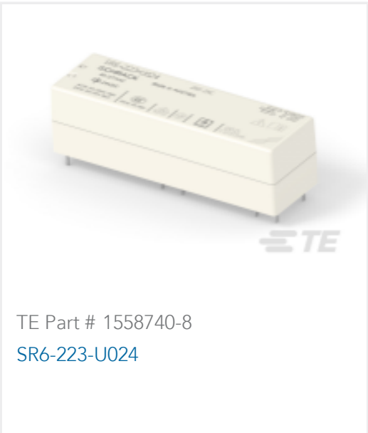
TE Part # 1558740-8 SR6-223-U024