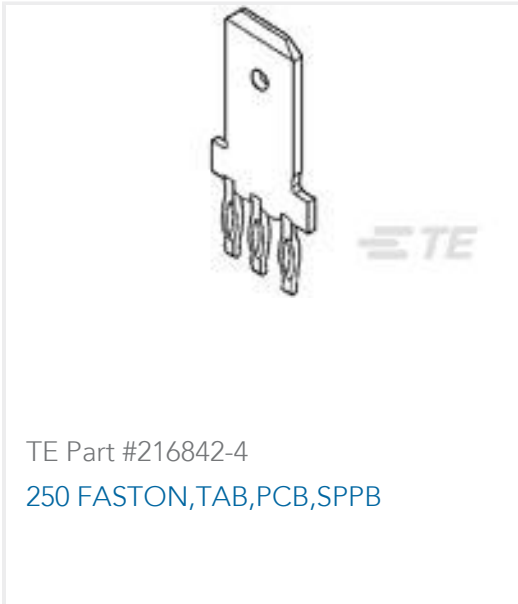
TE Part #216842-4 250 FASTON,TAB,PCB,SPPB