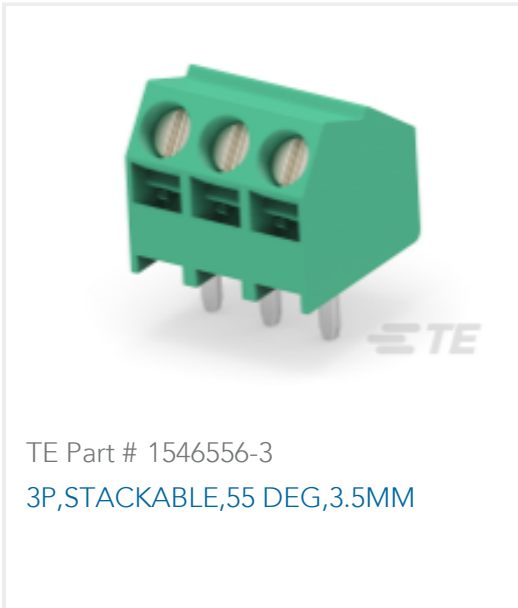
TE Part # 1546556-3 3P,STACKABLE,55 DEG,3.5MM