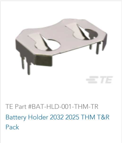
TE Part #BAT-HLD-001-THM-TR Battery Holder 2032 2025 THM T&R Pack