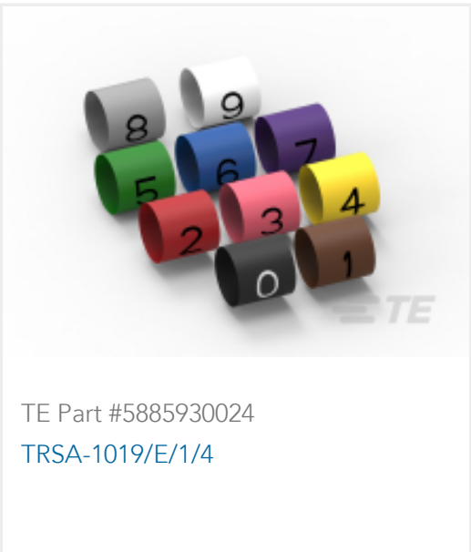
TE Part #5885930024 TRSA-1019/E/1/4