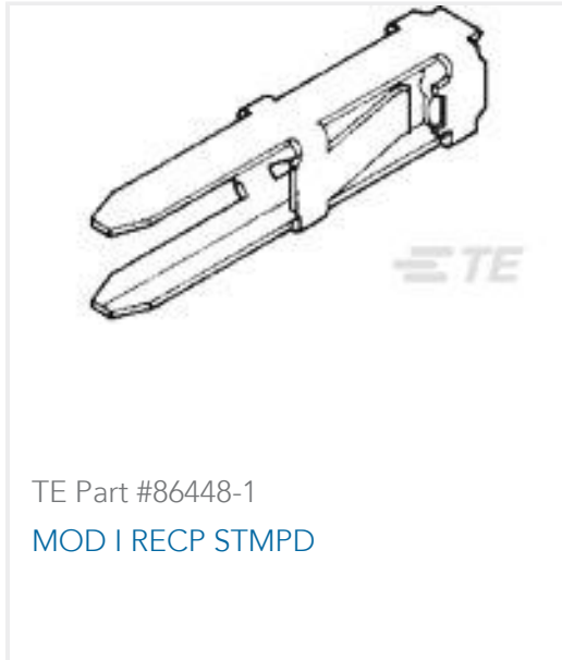
TE Part #86448-1 MOD I RECP STMPD