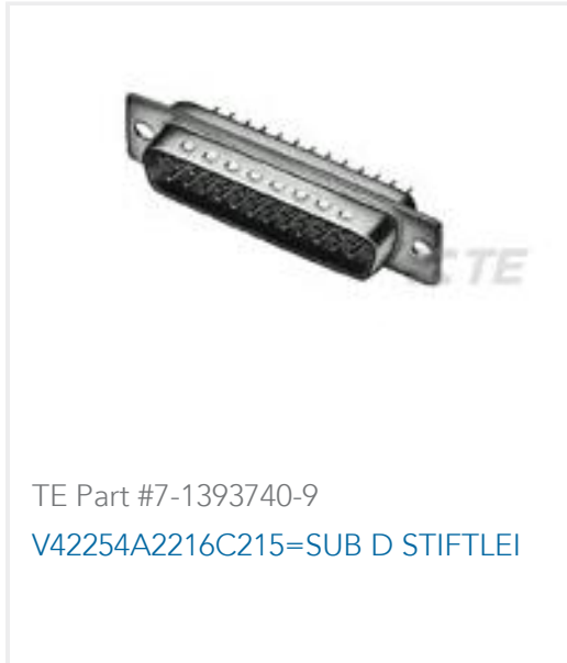
TE Part #7-1393740-9 V42254A2216C215=SUB D STIFTLEI