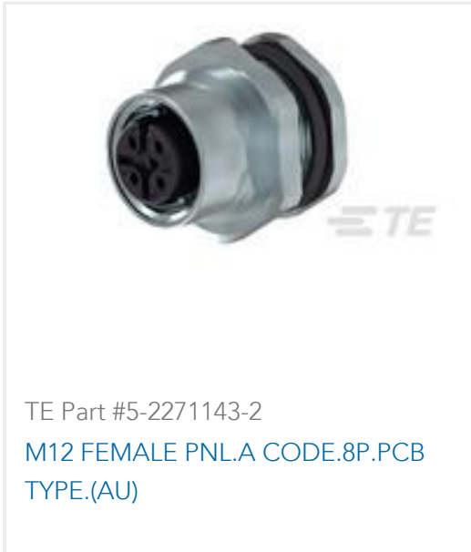
TE Part #5-2271143-2 M12 FEMALE PNL.A CODE.8P.PCB TYPE.(AU)