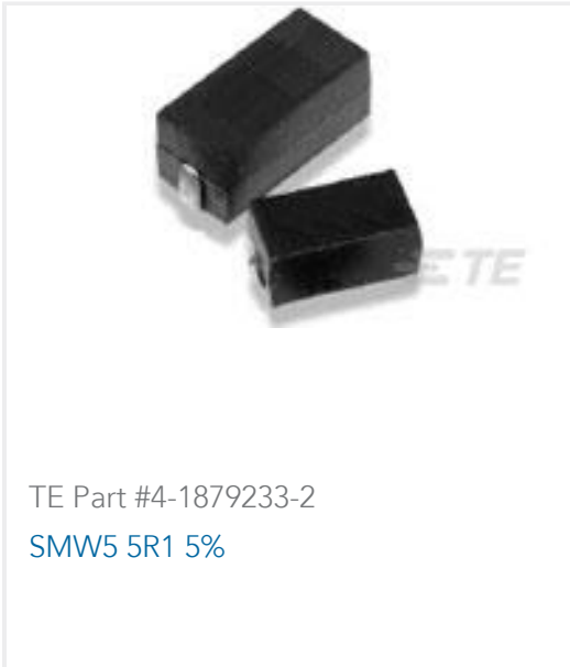
TE Part #4-1879233-2 SMW5 5R1 5%