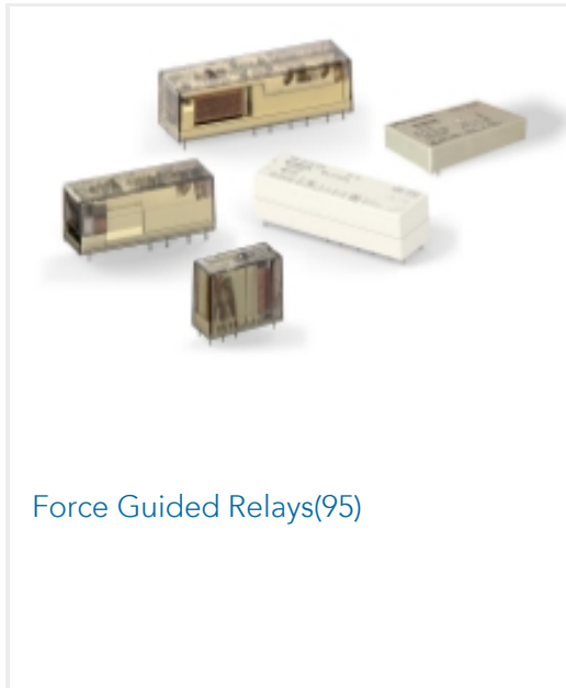
Force Guided Relays(95)