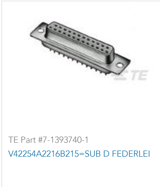
TE Part #7-1393740-1 V42254A2216B215=SUB D FEDERLEI