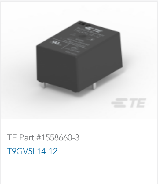
TE Part #1558660-3 T9GV5L14-12