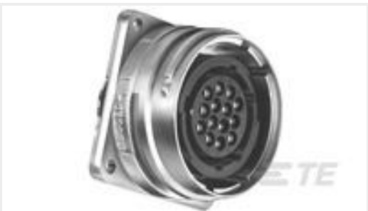
TE Part #208487-1 CMC RECEPTACLE ASSY,SIZE 22