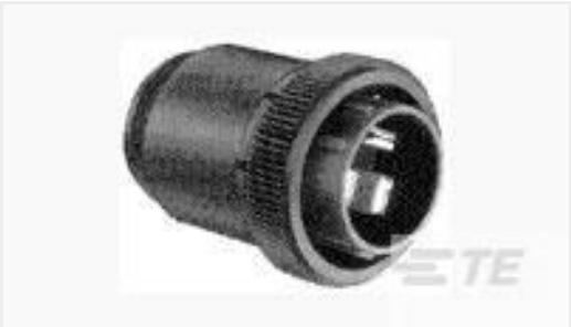
TE Part #206226-1 CPC PLUG ASSEMBLY SIZE 23-7