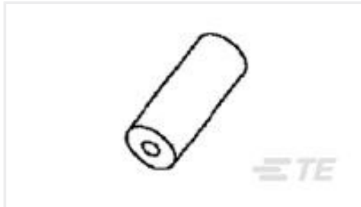
TE Part #1604121-5 REDUCING BUSH,175A,1/0-4AWG