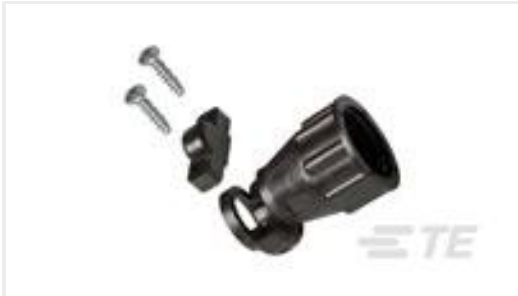
TE Part #1-206062-6 CABLE CLAMP KIT #11