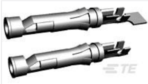
TE Part #66565-2 III+ SKT,24-20,TIN-LEAD,LP