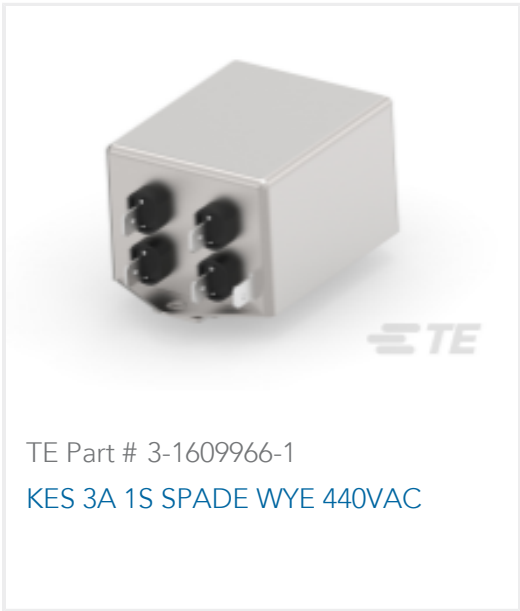
TE Part # 3-1609966-1 KES 3A 1S SPADE WYE 440VAC

This information is provided based on reasonable inquiry of our suppliers and represents our current actual knowledge based on the information they provided. This information is subject to change. The part numbers that TE has identified as EU RoHS compliant have a maximum concentration of 0.1% by weight in homogenous materials for lead, hexavalent chromium, mercury, PBB, PBDE, DBP, BBP, DEHP, DIBP, and 0.01% for cadmium, or qualify for an exemption to these limits as defined in the Annexes of Directive 2011/65/EU (RoHS2). Finished electrical and electronic equipment products will be CE marked as required by Directive 2011/65/EU. Components may not be CE marked. Additionally, the part numbers that TE has identified as EU ELV compliant have a maximum concentration of 0.1% by weight in homogenous materials for lead, hexavalent chromium, and mercury, and 0.01% for cadmium, or qualify for an exemption to these limits as defined in the Annexes of Directive 2000/53/EC (ELV). Regarding the REACH Regulation, the information TE provides on SVHC in articles for this part number is based on the latest European Chemicals Agency (ECHA) 'Guidance on requirements for substances in articles' posted at this URL: https://echa.europa.eu/guidance-documents/guidance-on-reach