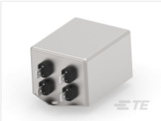
TE Part #4-1609966-2 KES 6A 1S SPADE WYE 520VAC