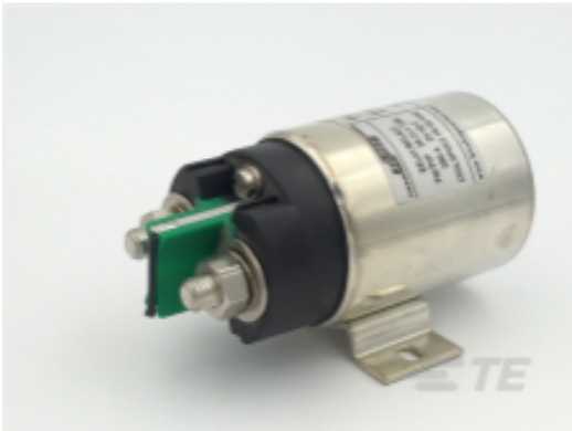
TE Part #K1021410 Relay 29-211-12