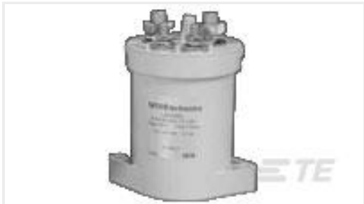
TE Part #4-1618388-6 LEV200A5NAA=RELAY, SPST-NO