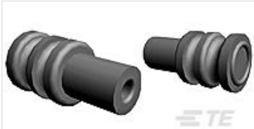
TE Part #963530-1 EINZELLEITERDICHTNG