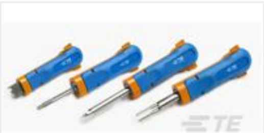
TE Part #5-1579007-3 EXTRACTION TOOL