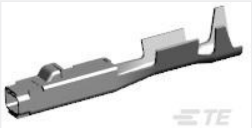
TE Part #1670144-1 MCON 1.2 CB REC SRC SN