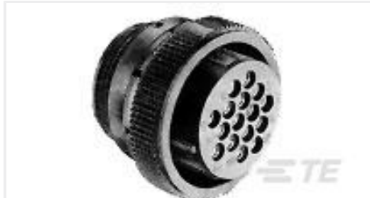
TE Part #182649-1 17-14 CPC PLUG RS