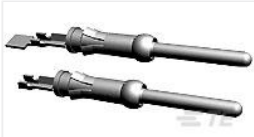
TE Part #1-66099-5 III+ PIN,18-16,TIN ,LP