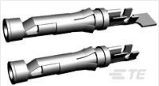
TE Part #1-66101-9 III+ SKT,18-16,TIN ,LP