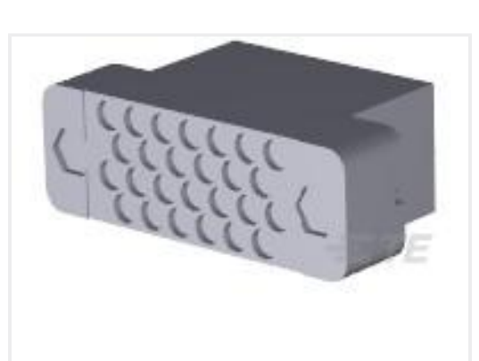
TE Part #200512-3 FEMALE BLOCK 26 PL.