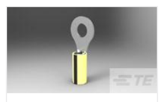
TE Part #323682 TERMINAL,PIDG R 16-14HD 1/4