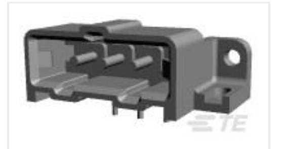
TE Part #207541-7 MMATE PIN HEADER ASSY,3P LF