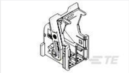
TE Part #953122-1 40W MQS COVER ASSY (15D)