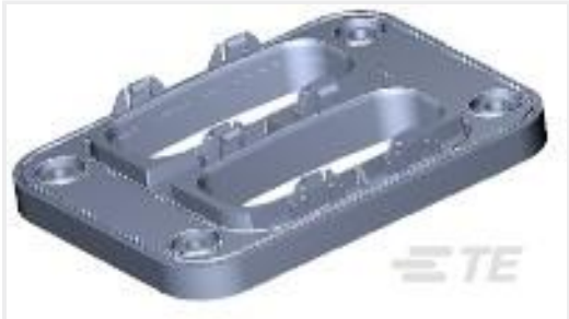
TE Part #1813123-1 ASSY FOR SUPPORT PLATE AND SEALING