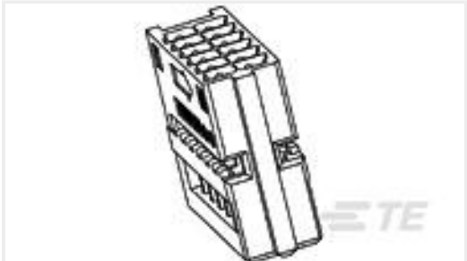
TE Part #185875-1 26POS MQS REC