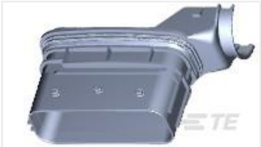
TE Part #2-1718324-1 1.5/2.8MM TAB HSG.,62POS.,SEALED