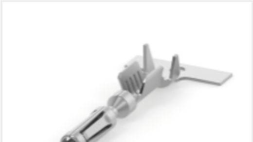
TE Part #770520-6 AMPSEAL,TERMINAL,TIN PLATE,22-24AWG WIRE