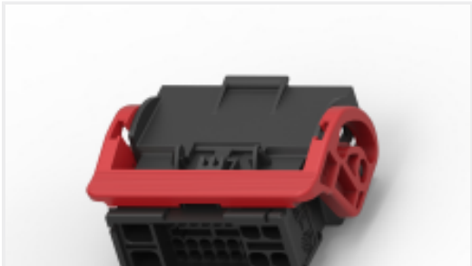
TE Part #2236046-7 32POS, MIXED, MALE CONN., CLIP2, COD A