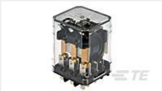
TE Part #5-1393117-8 KUP-11D55-24=KU