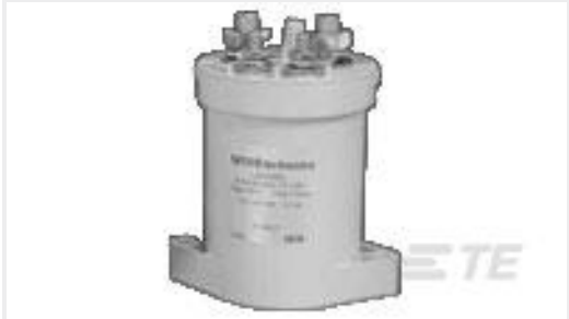
TE Part #5-1618388-5 LEV200H5ANA=RELAY, SPST-NO