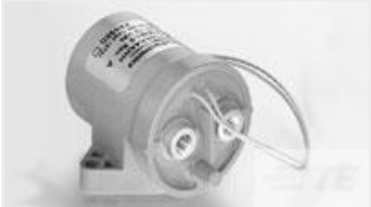
TE Part #4-1618391-1 LEV100A5ANH=RELAY,SPST-NO 24VDC VMT 15