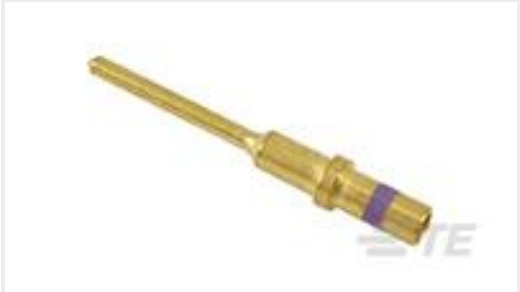
TE Part #0460-010-2031 PIN, SOLID, SIZE 20, 16-18AWG, AU