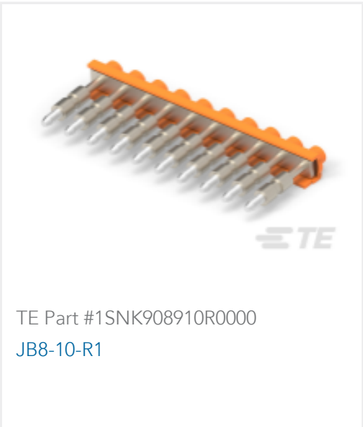
TE Part #1SNK908910R0000 JB8-10-R1