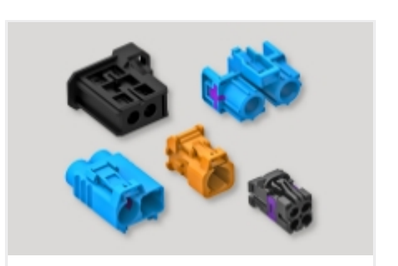
Data Connectivity Housings (398)