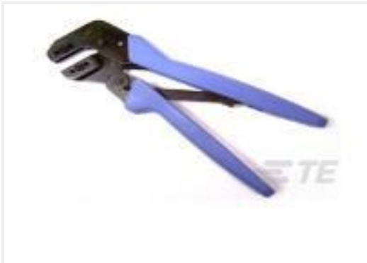
TE Part #58630-1 PROCRIMP HT&D 12-10 ULTRAFast