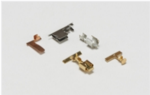
Special Purpose Terminals(1)