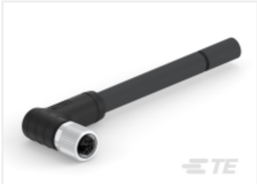
TE Part #T41514C9L14-002 RPC-M12L-4FR-1.0-PUR 16AWG BK