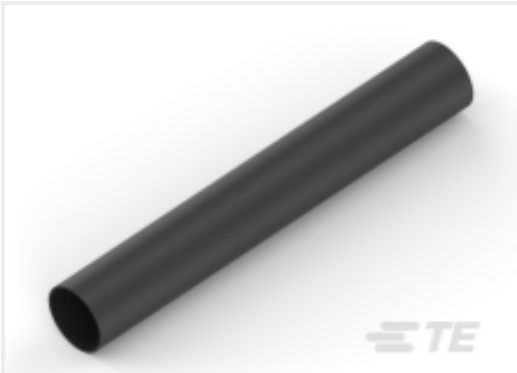
TE Part #NB09012001 ATUM-12/3-0-STK