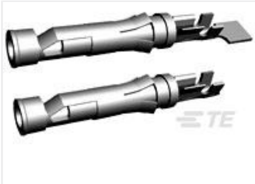
TE Part #66601-2 III+ SKT,18-14,30AU/FL,LP