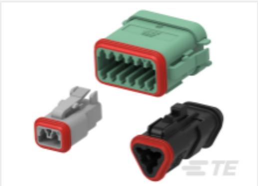
TE Part #CAT-J41-DDPC DEUTSCH DT Plug Connectors