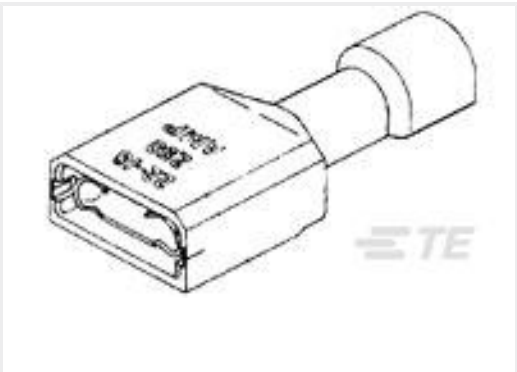
TE Part #3-520408-2 ULTRA-FAST 250 ASY REC 16-14 AWG TPBR