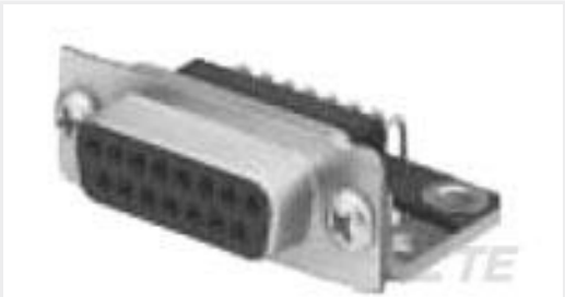
TE Part #5745116-2 50 RCPT RA/MS STD