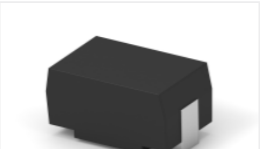
TE Part #CAT-C339-SM1 SMD Power Resistor: 7 Watt, 200-2M Ohm