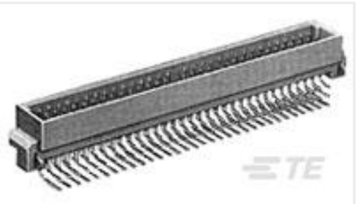
TE Part #5650947-5 ASSY,PIN,EUROCARD,TYPE C,LEAD-